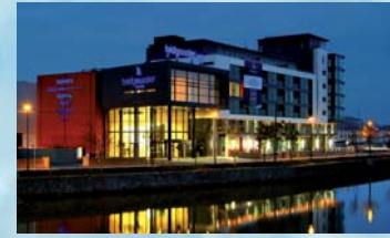
The Bridgewater Shopping Centre