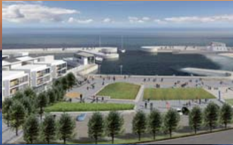
Greystones Harbour Project