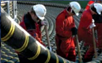
Subsea electricity cable that will link the UK and Ireland