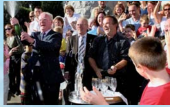
Aughrim - Tidy Towns Winner 2007