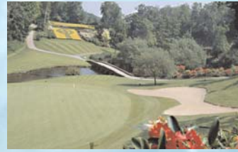
Druids Glen Golf Course