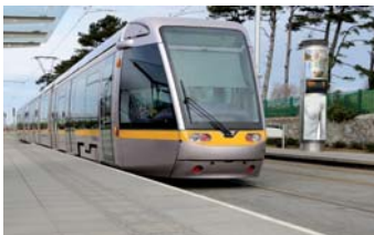
Proposed Luas extension to Bray