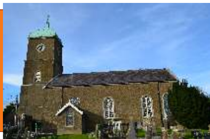
Wicklow Parish Church