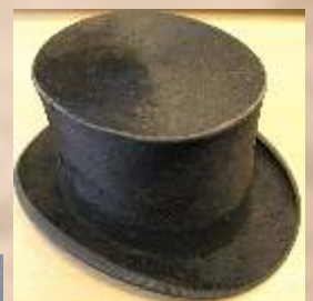
De Valera's top hat