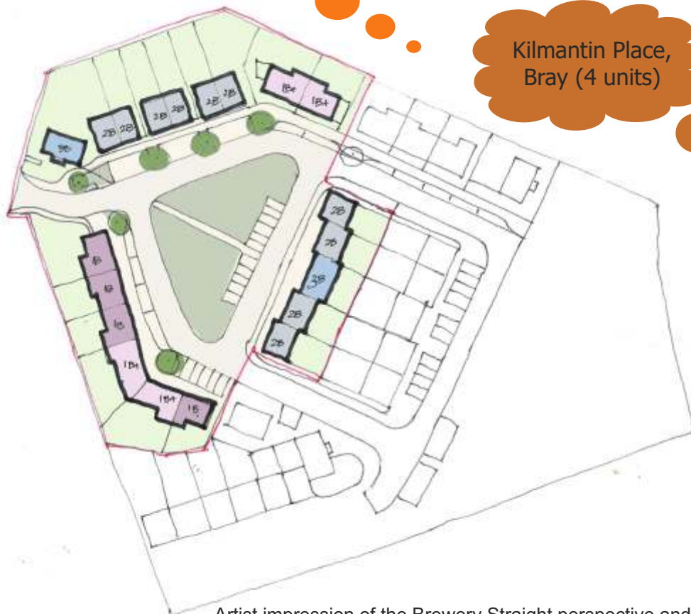
Artist impression of the Brewery Straight perspective and site layout