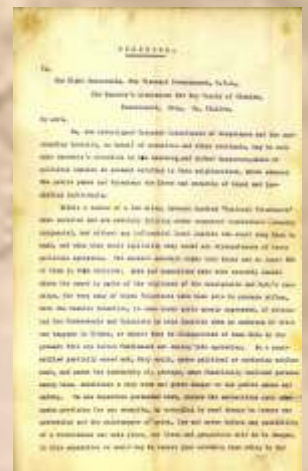
Letter (extract) from the Unionists of Greystones to the Viscount of Powercourt Pleading for Military Protection, circa 1914