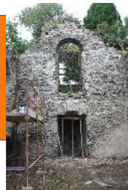
Masonry Repair Works at Killmurray Church, Newtownmountkennedy

Wicklow County Council, through funding provided by the Department of Arts, Heritage, Regional, Rural and Gaeltacht Affairs has allocated almost €90,000 to built heritage projects in County Wicklow in 2016. The Built Heritage Investment Scheme (BHIS) and the Structures at Risk Fund (SRF) are aimed at assisting owners in carrying out essential works to safeguard protected structures and buildings within Architectural Conservation Areas. There is an emphasis also, in supporting employment in the built heritage sector and in nurturing building conservation skills. Some of the buildings receiving support in 2016 include St. Saviours Church, Arklow, Killmurray Church, Newtownmountkennedy, Barravore Crusher Houses, Glenmalure, Wicklow Parish Church, Wicklow Town, St. Mary's Church, Blessington and Ballymurrin Farmhouse. These buildings contribute greatly to the richness and diversity of our built heritage stock in Wicklow and our associated sense of place.