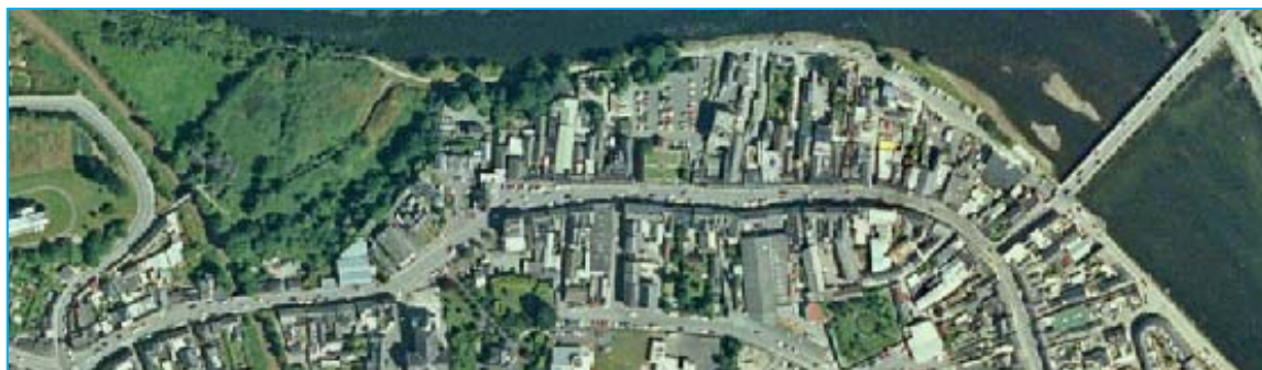
Arklow Main Street

The provision of adequate lands within a town capable of meeting projected future educational, community, sport and recreational uses is essential in order to meet needs of the future population. While Arklow is well serviced with schools, community facilities, sport and recreational facilities, the enhancement of these services will be required to accommodate the level of future growth envisaged.