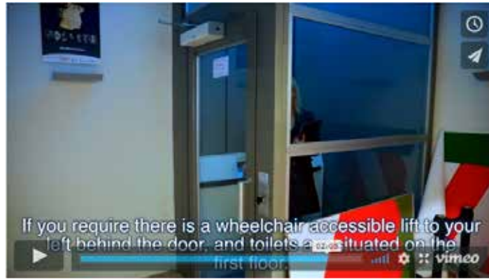
Wheelchair accessible lift

If you require there is a wheelchair accessible lift to your left behind the door and toilets are situated on the first floor.