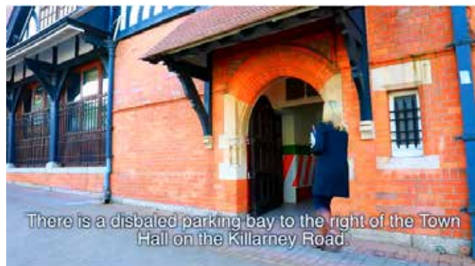
Entrance to Town Hall via Vevay Road

As you enter through the large door you will find a staircase in front of you which leads directly to the council chamber.