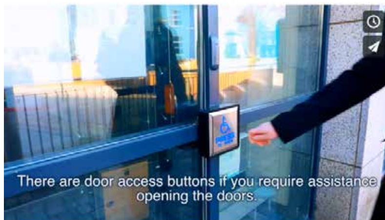
Door access button at front of building

Visitors must enter the building to the front. There are door access buttons if you require assistance opening the doors.