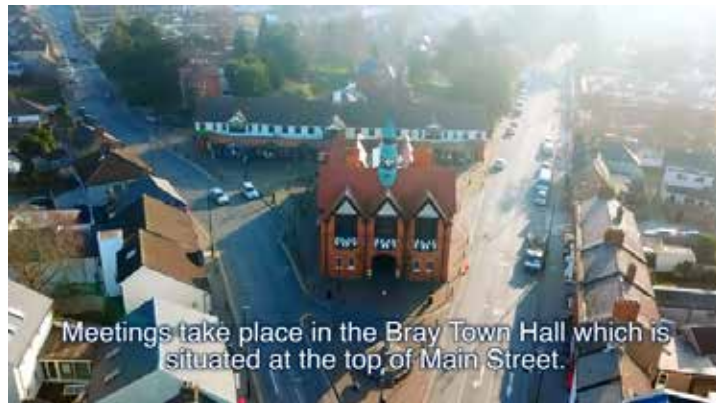
Bray Town Hall

Meetings take place in Bray Town Hall which is situated at the top of the Main Street. The entrance to the Town Hall is on the Vevay Road side of the building.