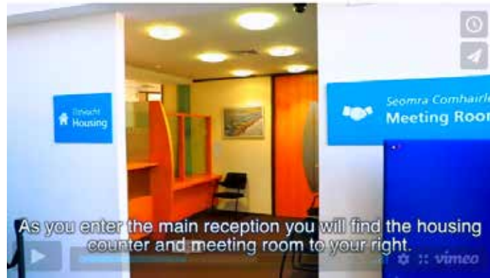
Housing counter and meeting room

As you enter the main reception you will find the housing counter and meeting room to your right hand side.