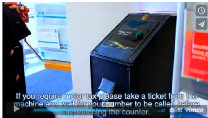
Motor tax ticket machine

Bray Municipal District holds monthly council meetings at 7.30pm on the first Tuesday of the month except August. These meetings are open to the public to attend.