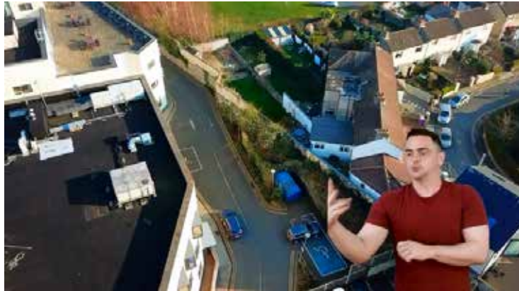
Disabled parking bays

If you need to use the disabled parking bays continue ahead or alternatively turn left into the private car park. Be aware that spots on the left are set down only. There are 3 disabled parking bays; 2 on the right and 1 further down on the left. Ramp access is behind the one on the left. The car park will often fill during busy periods. If this is the case you are advised to park in another of bray's ample car parks nearby.