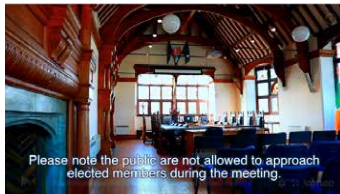
Public seating in chamber

Public seating is to the rear of this area of the council chamber area. Please note, the public are not allowed to approach elected members while seated during the meeting.