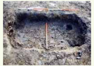
Rathmore, clay lined trough.