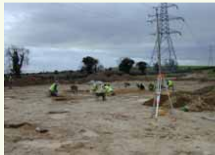
Rathmore, ritual/burial site.