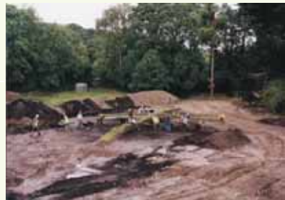
Rathmore, burnt mound.