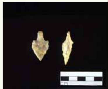
Killadreenan, flint arrowheads.

A possible medieval occupation was excavated in Timore Lane . Here the remains consisted of two roughly linear shaped features emerging from an unexcavated area on the west facing slope of a large hill. It is suspected that a large portion of this site continues underneath the field surface outside the limits of the new N11. The features were in an area which documentary sources refer to as being the location of a small village dating from the 17 th and 18 th Centuries. The largest and most northerly of the features appeared to have resulted from an episode of burning and may represent a hearth (any place where a pit was dug and a fire built, sometimes identified by charcoal, baked earth, ash, discoloration, or an outline of stones). A second feature appeared to constitute an indistinct shallow trench, possibly a wall foundation around the hearth. Radiocarbon dating may provide an indication as to the date, however the exact form and function of these pits/trenches remains unknown. They may constitute partial remains of the 17 th and 18 th century village previously mentioned. Equally, the site may be the remains of industrial activity similar to that found at Inchanappa Upper (see poster No. 2). Finally the site may have been the location of ritual activity. This appears very unlikely, however without further investigation the form and function of the site will remain unknown.