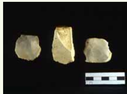
Rathmore, flint tools from prehistoric activity.