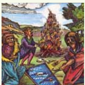
Reconstruction of a wood lined trough.

In Rathmore Townland about 2km north of Ashford, the remains of a possible enclosure were uncovered. This feature also extended beyond the limit of excavation of the new N11 road route. It appears to represent a section of a boundary ditch, which may have enclosed an area to the west. Here a slight mound along a high ridge may indicate an area of habitation within the enclosure. The fills of the ditch suggest that following its excavation it was allowed to fill up naturally before being deliberately filled perhaps as a result of abandonment of the site. The discovery of medieval pottery here suggests a medieval date.