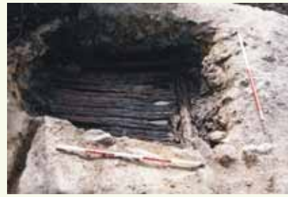
Rathmore, wood lined trough.