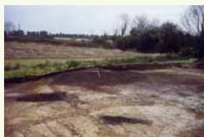
Rathmore, burnt mound.