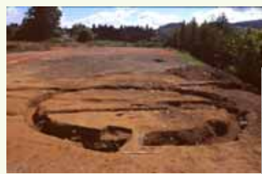
Killadreenan, ritual/burial site.

Three main areas of archaeological ritual/burial activity were identified along the proposed road route; first at Rathmore , second along the flood plain of the Vartry and Rathnew Rivers and third within the townland of Killadreenan at the very northern end of the road route. In the Townland of Killadreenan a ring ditch was excavated. This circular ditch (ditches are associated with defensive structures, as a means of drainage or as a construction trench) measured about 10m wide and was situated on a flat plateau at the top of the steep north slope of the Chapel River valley. The ditch encircled a central pit. Pottery and flint from the fills of the ditch have been provisionally dated to the Bronze Age 2000 - 500 BC.