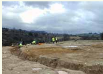
Rathmore, ritual/burial enclosure.