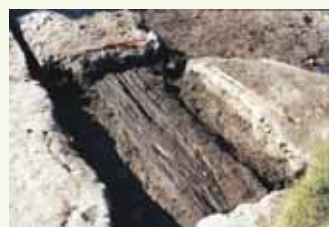
Rathmore, wood lined trough.