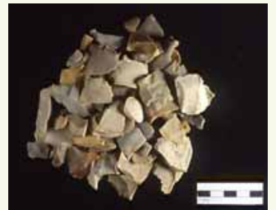
Rathmore, flint assemblage.