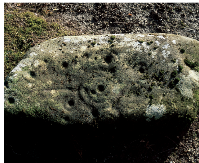
An example of rock art from Humewood, near Kiltegan.