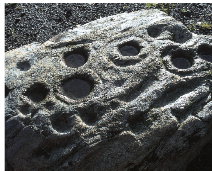
Cup and rings on a boulder from Baltynanima, near Roundwood.