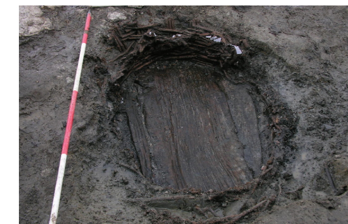
A wooden trough found during archaeological excavation of a fulachta fiadh at Ballyclogh near Redcross.