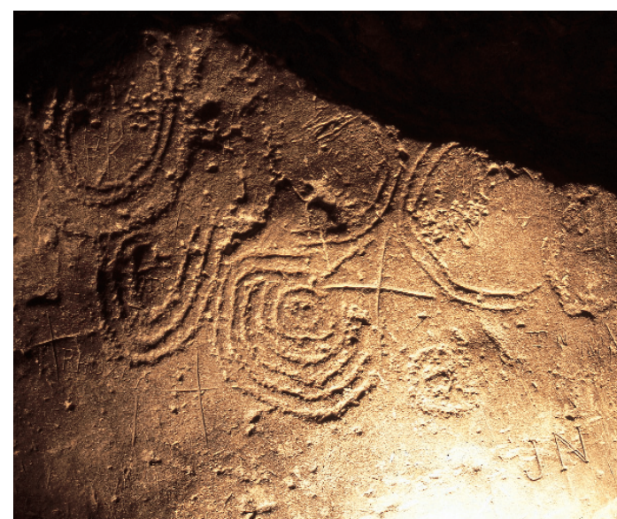
Decorated stone from Tornant, near Dunlavin.