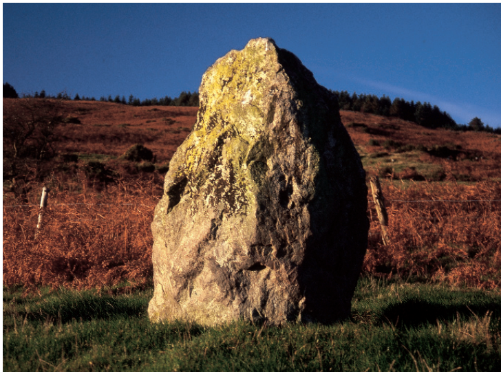
Top: Part of a musical instrument found in the wooden trough of a fulacht fiadh excavated at Charlesland near Greystones (photo: courtesy of Margaret Gowen & Co. Ltd).