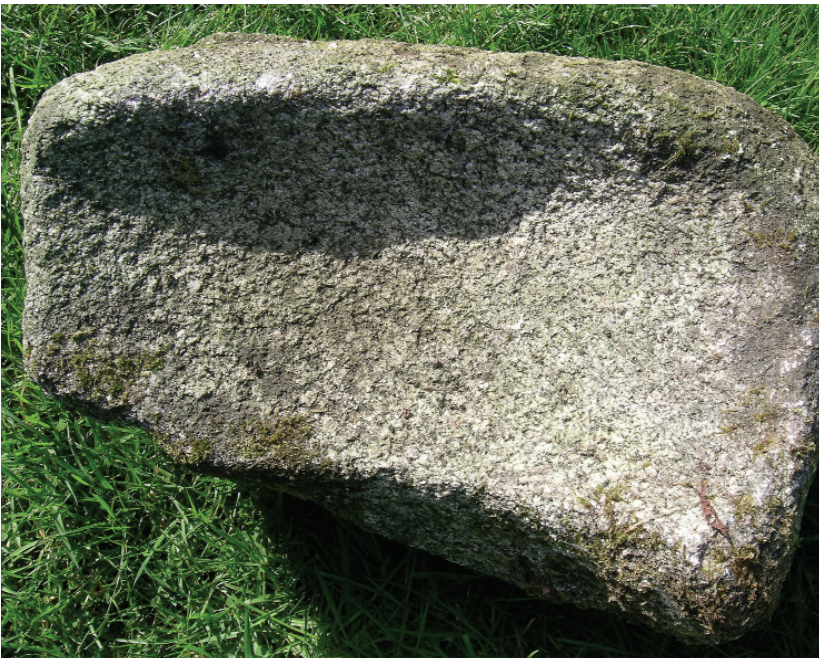
Left: Quern for grinding cereals, from Ballintombay, near Greenane.