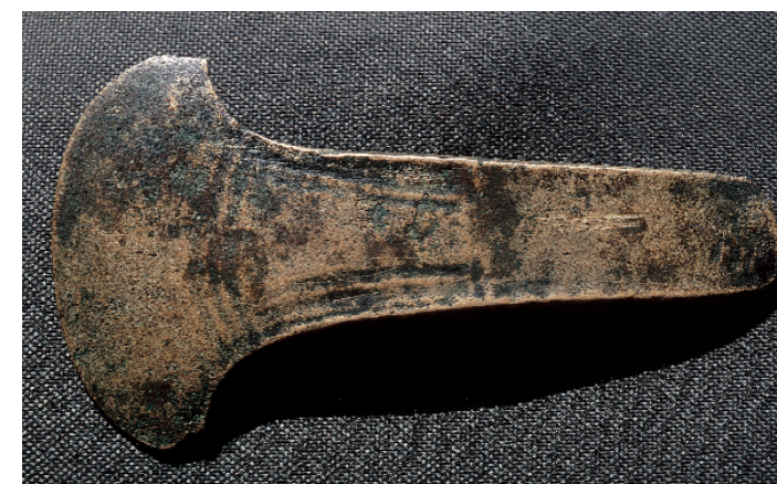
Copper axe from Sunny Bank, Bray.

For thousands of years stone was the main material used to make objects such as axes, knives and arrowheads. Then came a new invention—the use of metal. The revolutionary idea of producing objects from metal, initially copper, arrived into Ireland nearly 4,500 years ago. Copper can be found naturally in rock. In order to separate the copper from the rock it was smelted at very high temperatures. The copper was made into cakes, almost like pancakes, and examples of these have been found at Monastery near Enniskerry. These cakes of copper could be more easily transported around the country, and could be melted down by a metal-worker and poured into a mould to make an object such as an axe or dagger. Examples of these earliest metal axes have been found in many places around Wicklow. Over time these early metal-workers