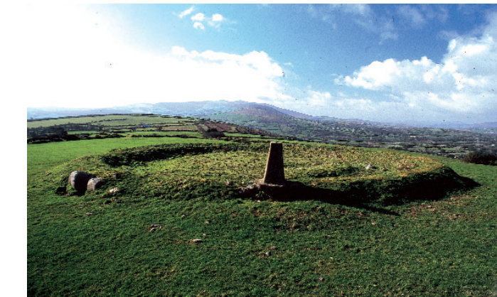
Ring-barrow at Killeagh, near Avoca.

Over time large stone tombs went out of fashion, and new forms of burial monuments were built as places to bury the dead. The remains of the person who died were usually cremated, and placed within a specially made pot or urn. This was then placed in a small grave. Sometimes a large mound of earth or a 'cairn' of stones was placed over the grave. Sometimes a circular ditch and bank were placed around the grave, forming a 'barrow'. An example of this can be found at Killeagh between Avoca and Aughrim.