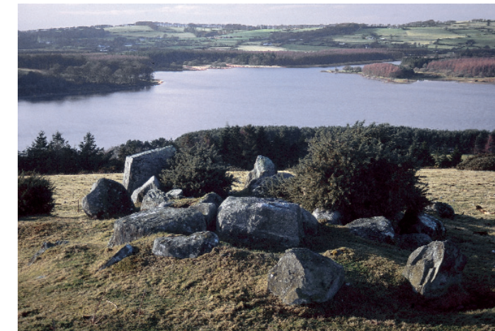
Wedge tomb at Carrig, near Lackan.