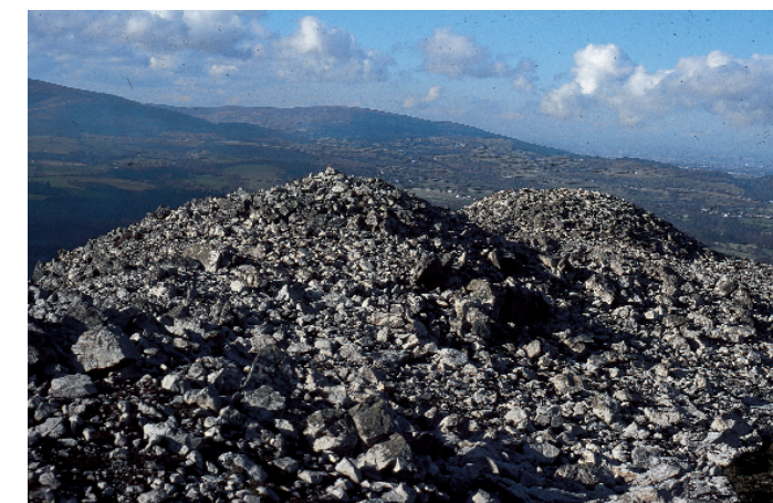
Cairns on the shoulder of the Great Sugar Loaf.

learned that if they mixed tin with copper it formed bronze, which was stronger than copper. For this reason, this period of archaeology is known as the Bronze Age. Apart from bronze, these early metal-workers also used gold to make wonderful ornaments.