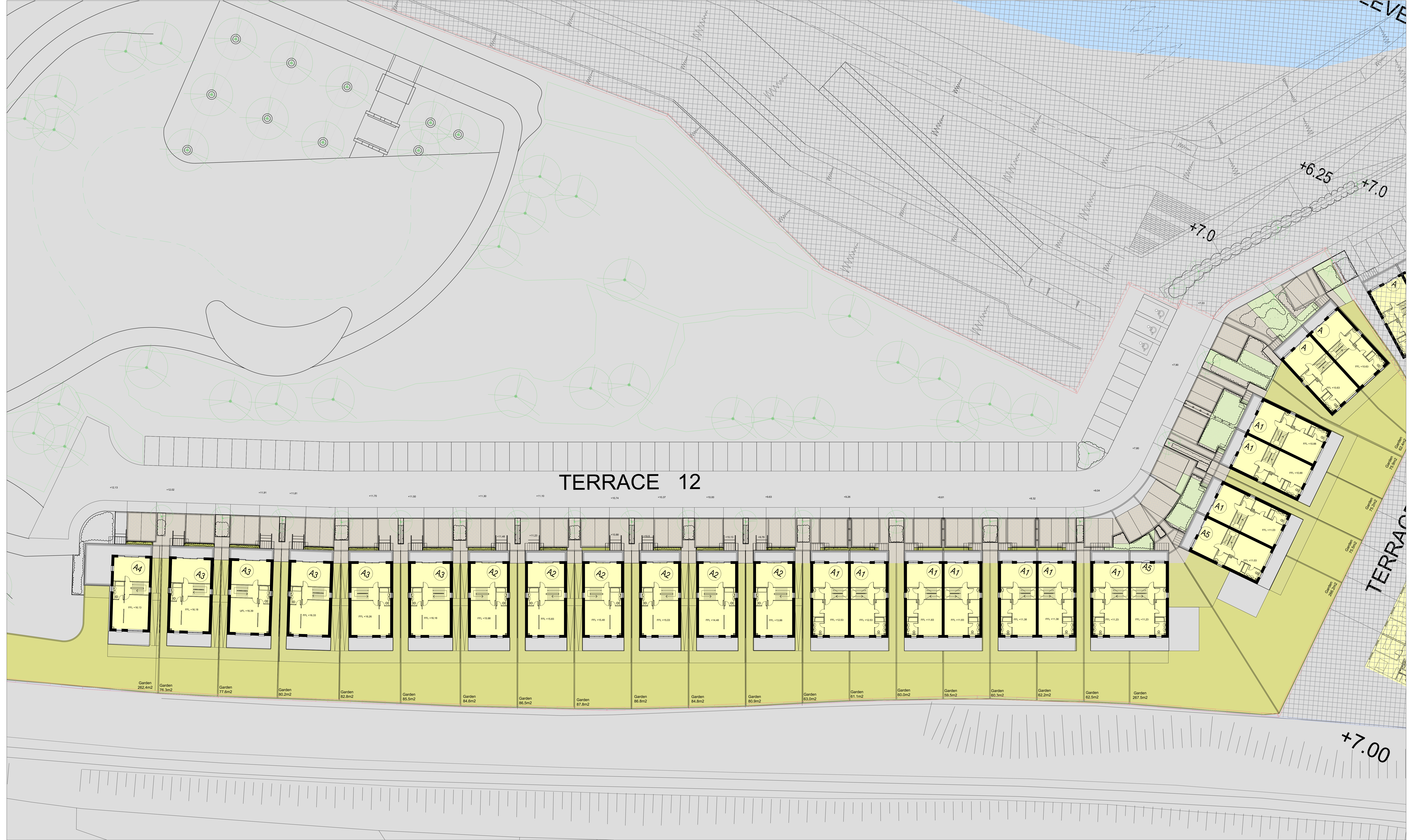
FIRST FLOOR SITE LAYOUT_T12 AS PROPOSED

IMPORTANT NOTES: ALL WORK TO BE CARRIED OUT IN ACCORDANCE WITH THE CURRENT BUILDING REGULATIONS ALL DIMENSIONS TO BE CHECKED ON SITE BEFORE WORK IS CARRIED OUT FIGURED DIMENSIONS ONLY TO BE TAKEN FROM THIS DRAWING. ALL CONSULTANTS ARE TO BE NOTIFIED OF ANY DISCREPANCIES. THIS DRAWING TO BE READ IN CONJUNCTION WITH THE RELEVANT STRUCTURAL ENGINEERS OR M&E ENGINEERS DWGS. & SPECIFICATION