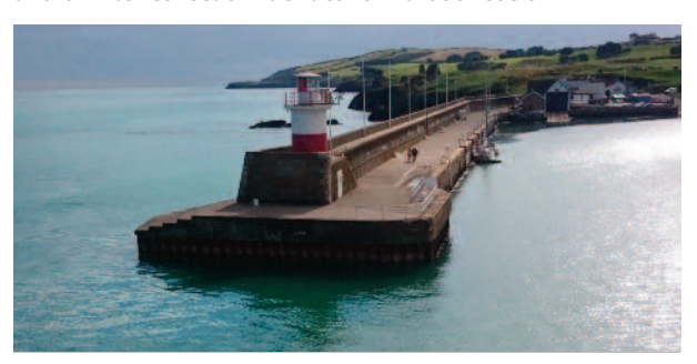
Wicklow Port Pier

Since taking over Wicklow Port, Wicklow County Council has carried out risk assessments and created a new safety statement for the port and its users. The Council will be introducing induction training for employees and safety training for employees, port users and visitors. It has resolved long standing problems with navigation lights and installed waste oil and oil filter collection facilities for harbour users.