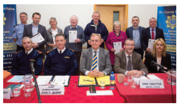
Launch of Wicklow County Council Joint Policing Committee 6-year Plan

LECP 2016–2020 contains 10 high level goals, 21 local objectives and more than 140 local actions. In addition, it sets out outcomes and timeframes for the delivery of the various elements. These will be assessed on an annual basis and a progress report will be presented annually throughout the lifetime of the plan.