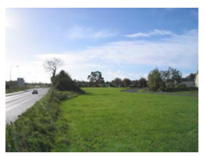
Open space at Glenbrook Park

Indicative target population figures for Greystones/Delgany are set out in the Wicklow County Development Plan 2004-2010. In implementing the County Development Plan, the target population must reflect the carrying capacity of the physical environment and infrastructure and the potential of the settlement to adequately provide for the needs of its residents.