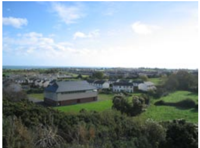
Killincarrig Community Centre

Outside of the open spaces in residential estates there is poor provision of public green space, with there being no distinct town park or village greens. The settlement is lacking in a modern and multi-purpose indoor sports facility and swimming pool.