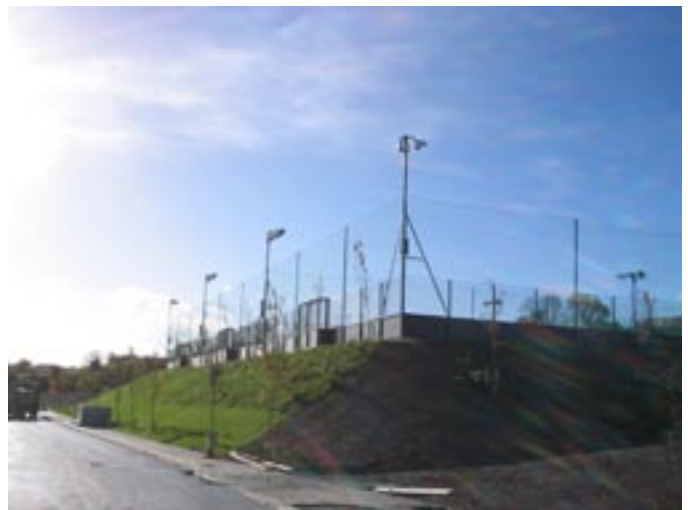
Charlesland Astro-turf Pitches