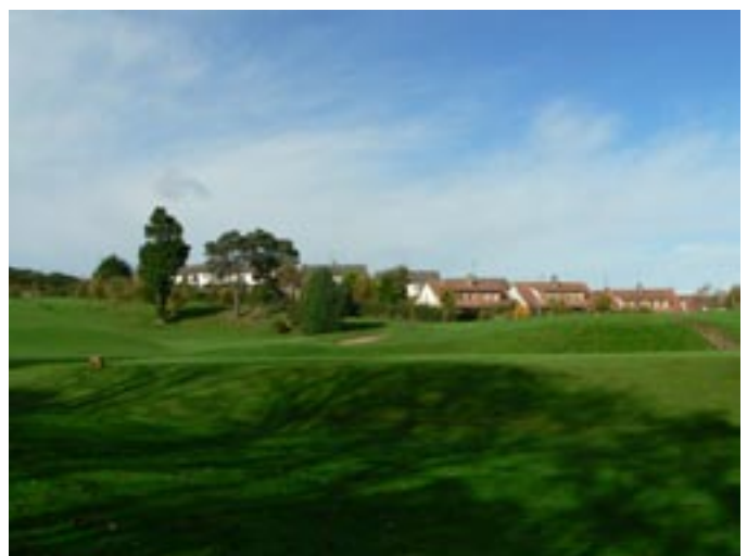
Greystones Golf Club