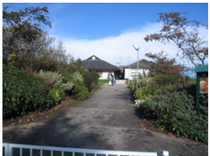
Delgany National School