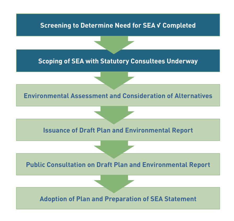
Figure 3.1: Overview of SEA Process