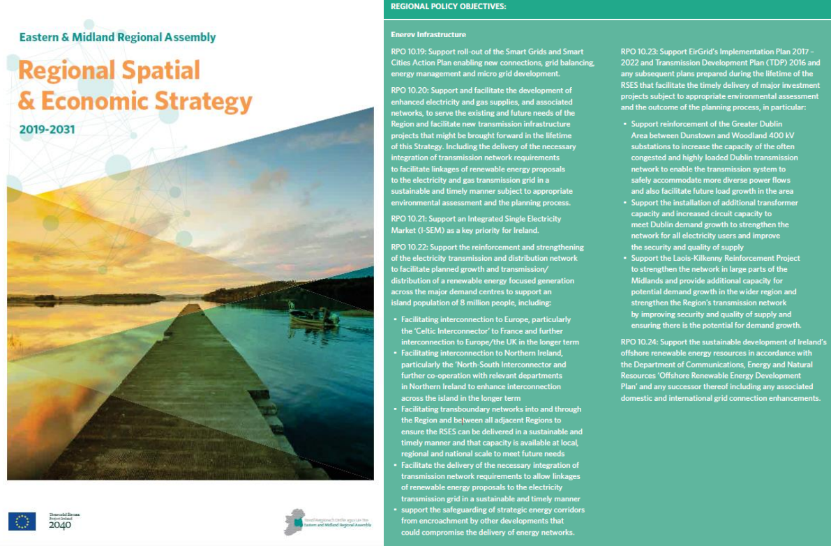
Figure 1: Policy Objectives from the Eastern and Midland Spatial and Economic Strategy (Section 10.3 Energy)

In this context the policies and objectives in the adopted Regional Spatial and Economic Strategy (Section 10.3 Energy) should be reviewed and considered as an example of robust and sustainable policies and objectives. The planning authority may consider these adequate for inclusion in the forthcoming draft. An extract of the relevant sections of the Regional Spatial and Economic Strategy is attached for convenience. Regional Policy Objective 10.19-10.24 of the RSES should be included, where applicable, in the forthcoming plan.