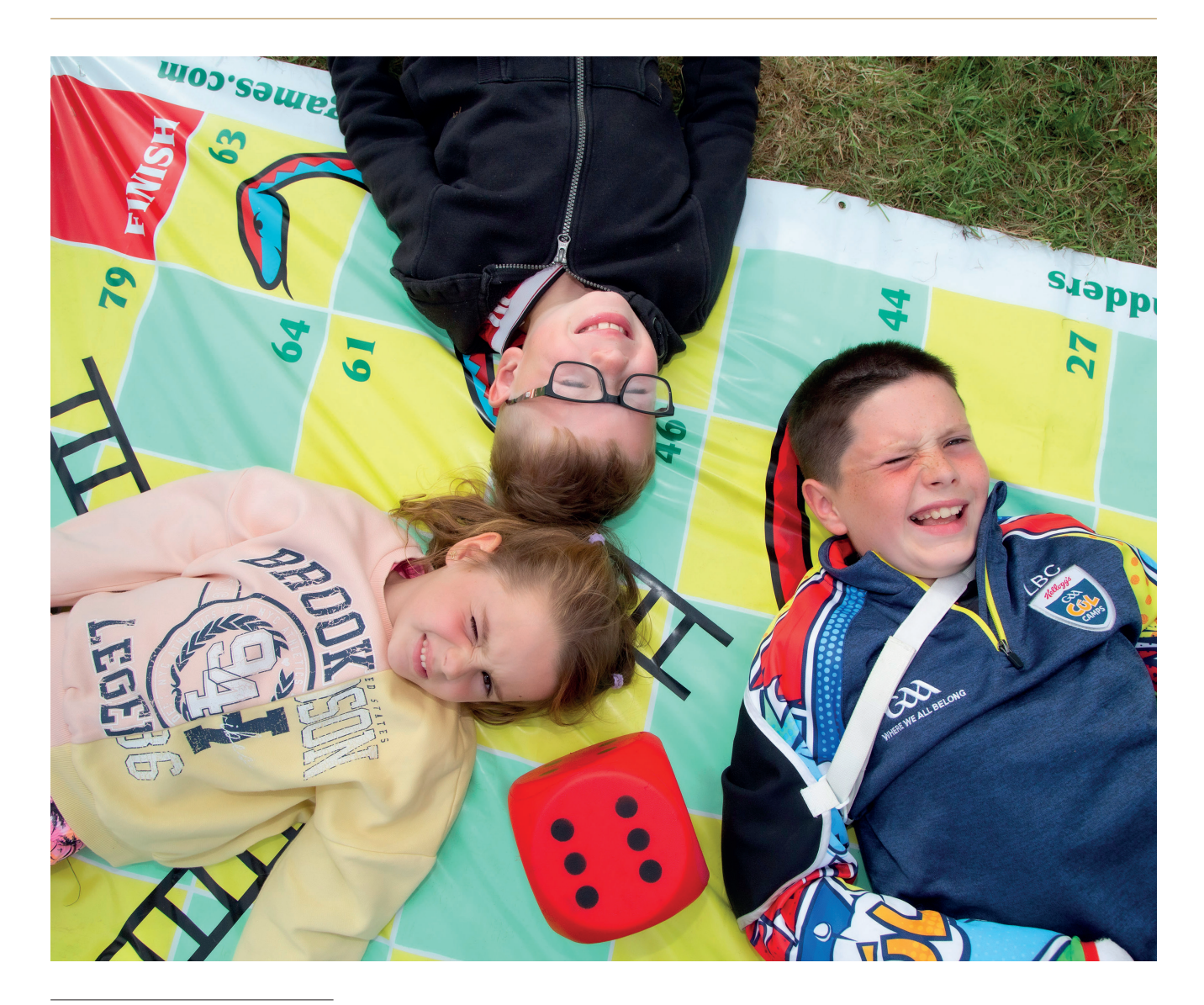
Rathdrum Summer Songs Inland & by the Sea.

just over one million euro for the development of creative initiatives in the county. The programmes which have been extended into communities reflect new partnerships working across the Wicklow Culture and Creativity Team. Creative Ireland has provided welcome investment to augment the strategic areas of all of our work. This investment is reflected not only from a monitory and organisational perspective but has also created work which has been deeply moving for participants and left a legacy of place based creative practice primed for development in two of our largest rural towns.