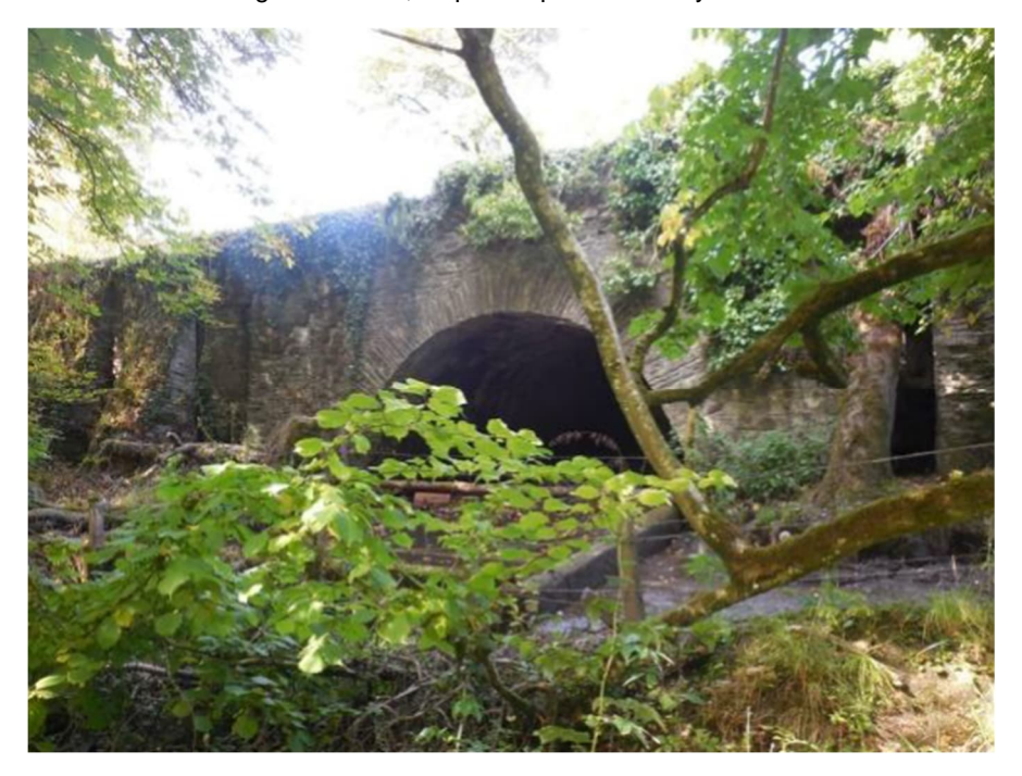
Plate 2: The tunnel to Russborough House (4256).