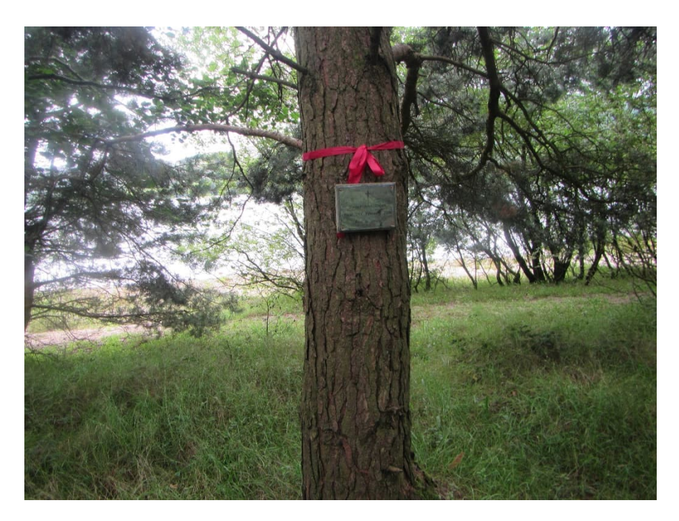
Plate 5: Valleymount memorial erected post February 2018.