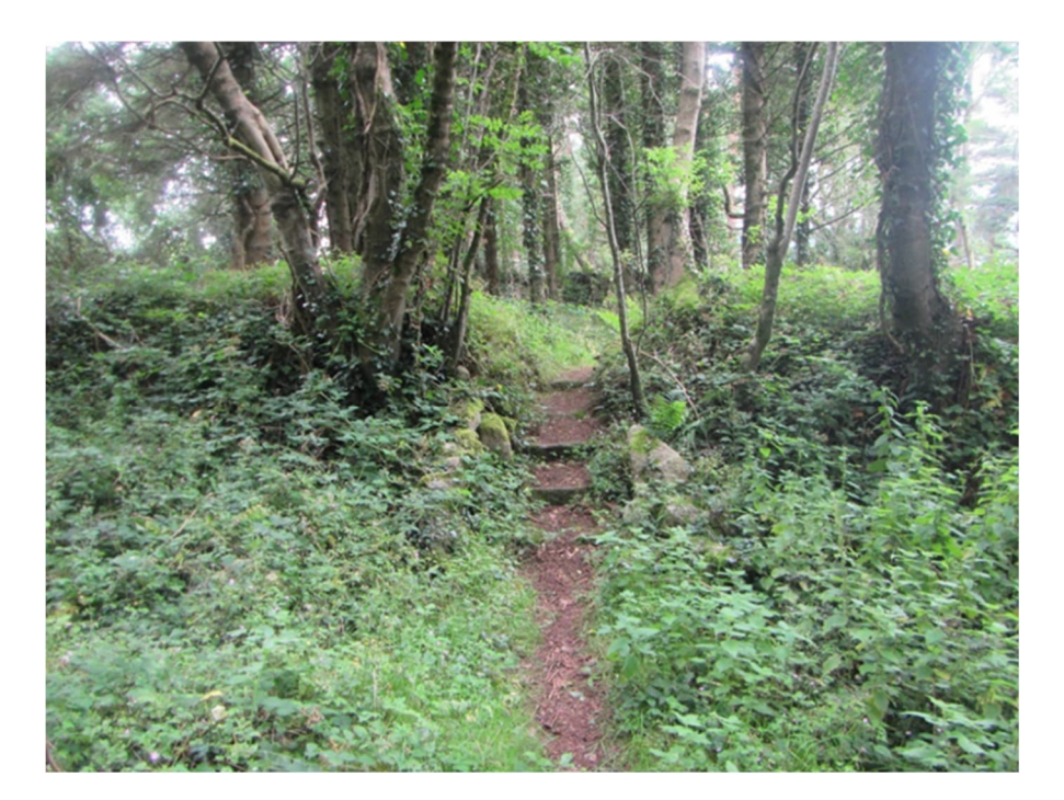
Plate 1: The existing stone walls, steps and paths in Valleymount townland.