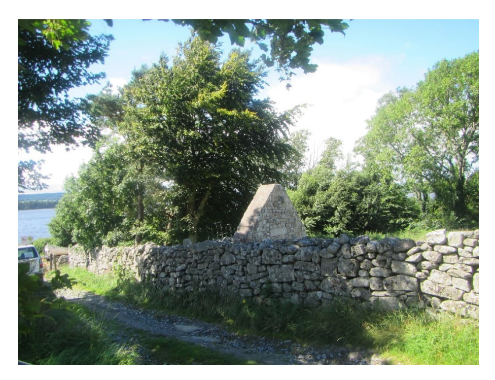
Plate 3: Biddy Mulvey's Cottage (RPS ref 10-5).