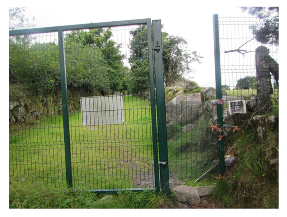
Plate 4: Cross Inscribed Stone (WI010-024).