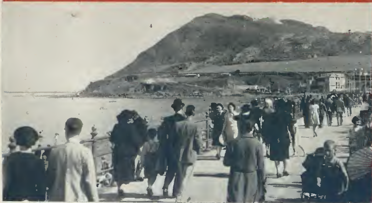
The Promenade, Bray—looking towards Bray Head