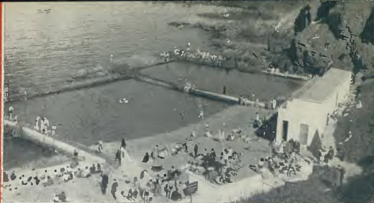
The Swimming-Pools at Naylor's Cove