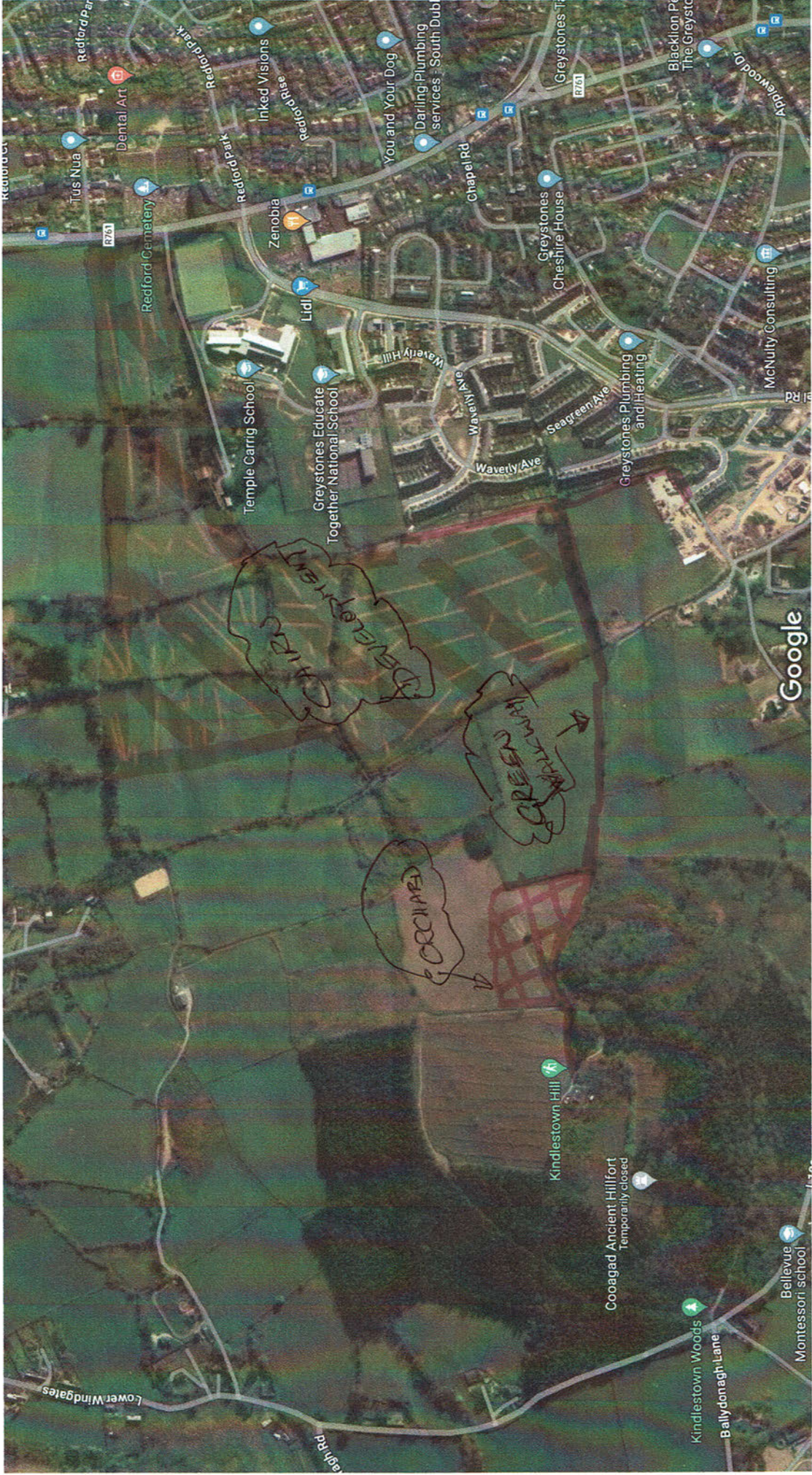
Imagery ©2023 CNES / Airbus, Maxar Technologies, Map data ©2023 100 m