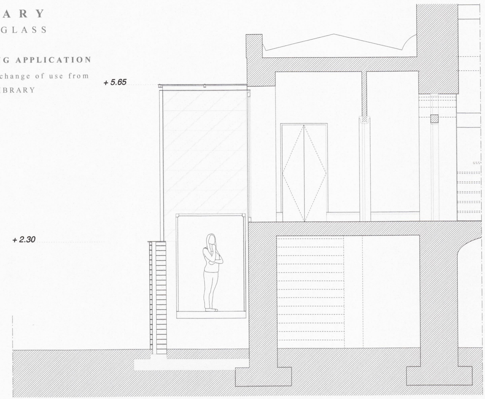
1 SECTION AA 1:50 @ A2 1:100 @ A4