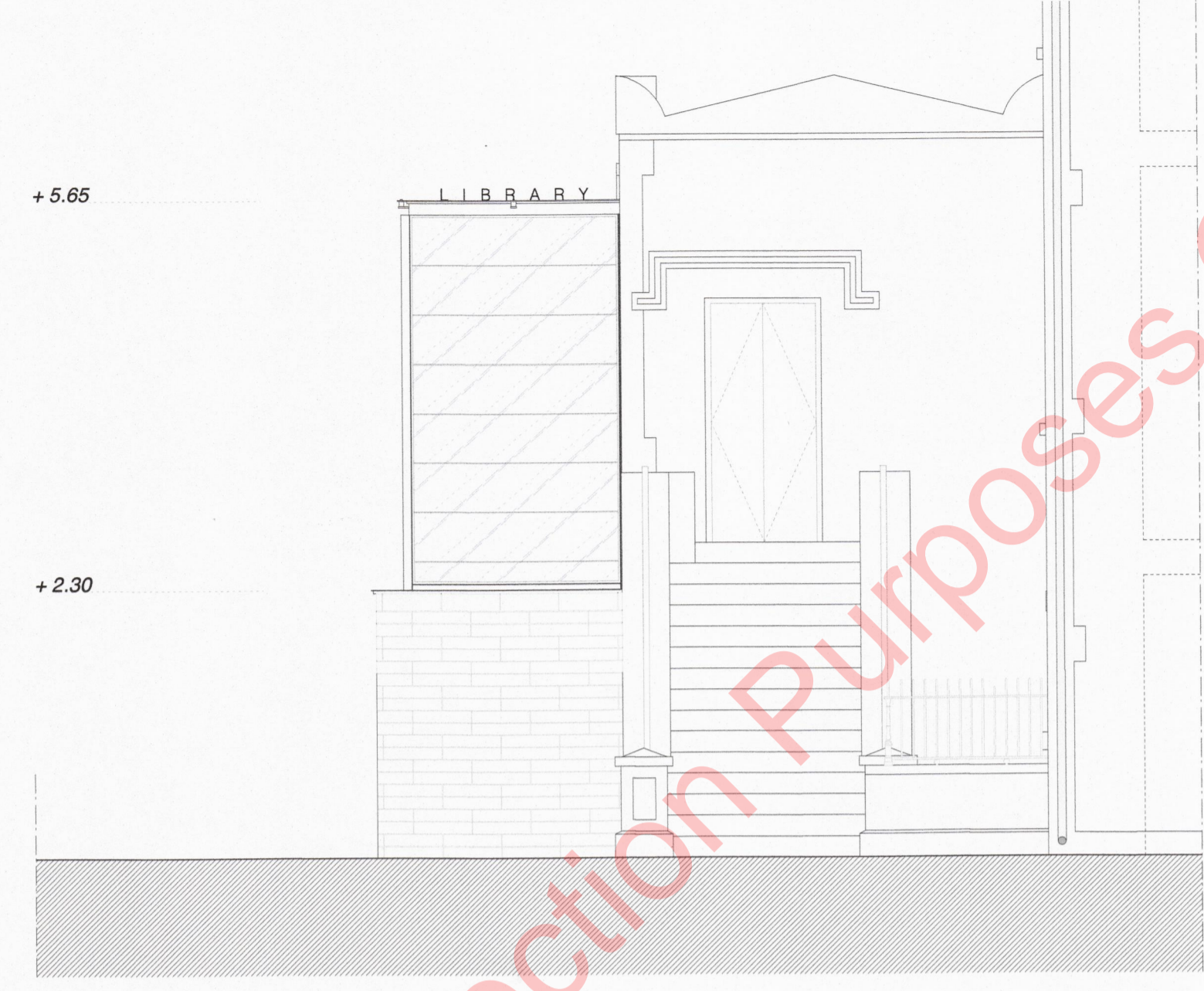
2 SOUTH ELEVATION 1:50 @ A2 1:100 @ A4