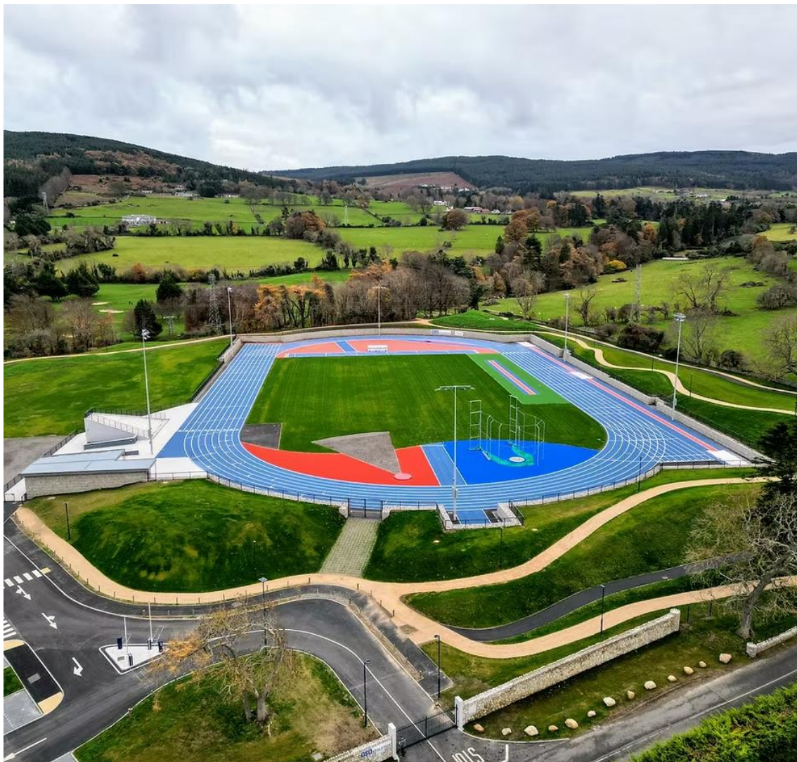
Example of a track in a suburban/ rural setting. Dundrum A.C South Dublin