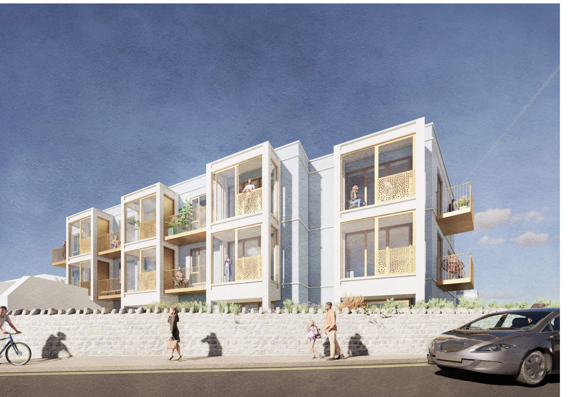
3D VISUALISATIONS - SCENE 8

All dimensions to be checked on site. Figured dimensions take preference over scaled dimensions. Any errors or descrepancies to be reported to the Architects. This drawing may not be edited or modified by the recipient.