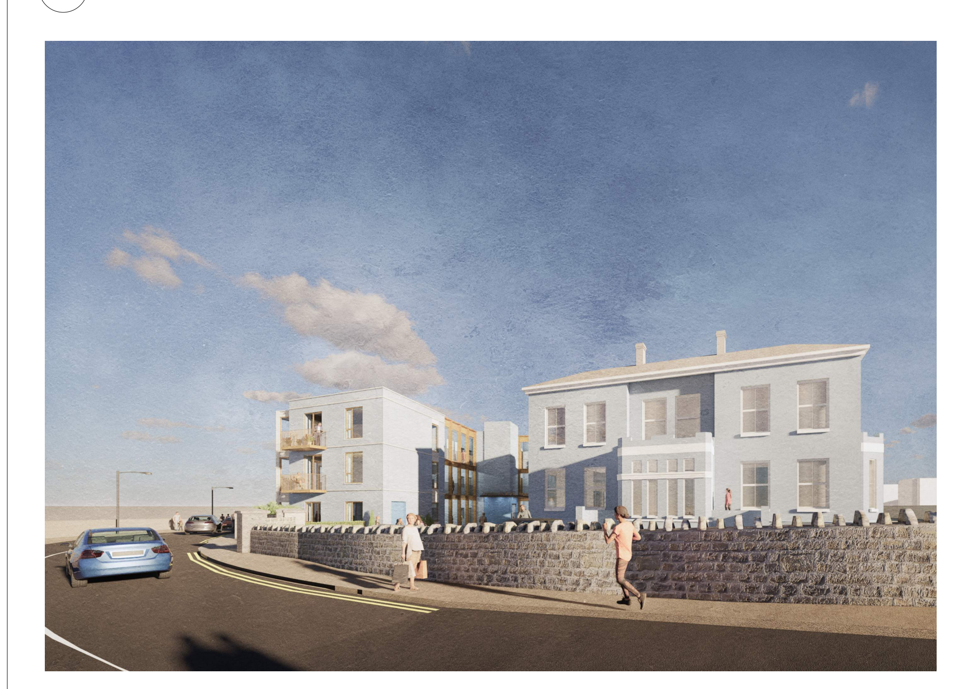
3D VISUALISATIONS - SCENE 7