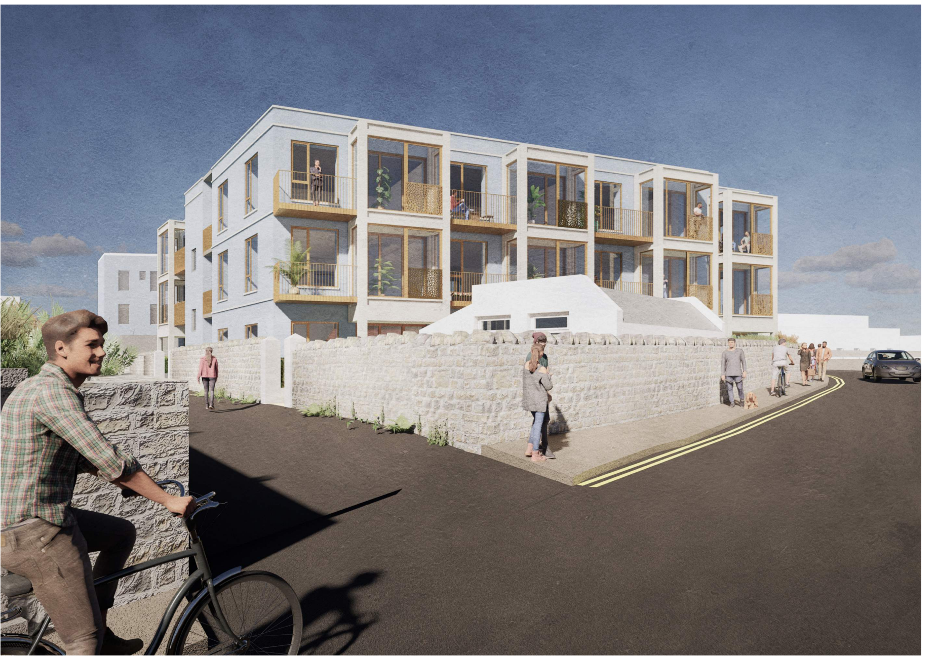
3D VISUALISATIONS - SCENE 6