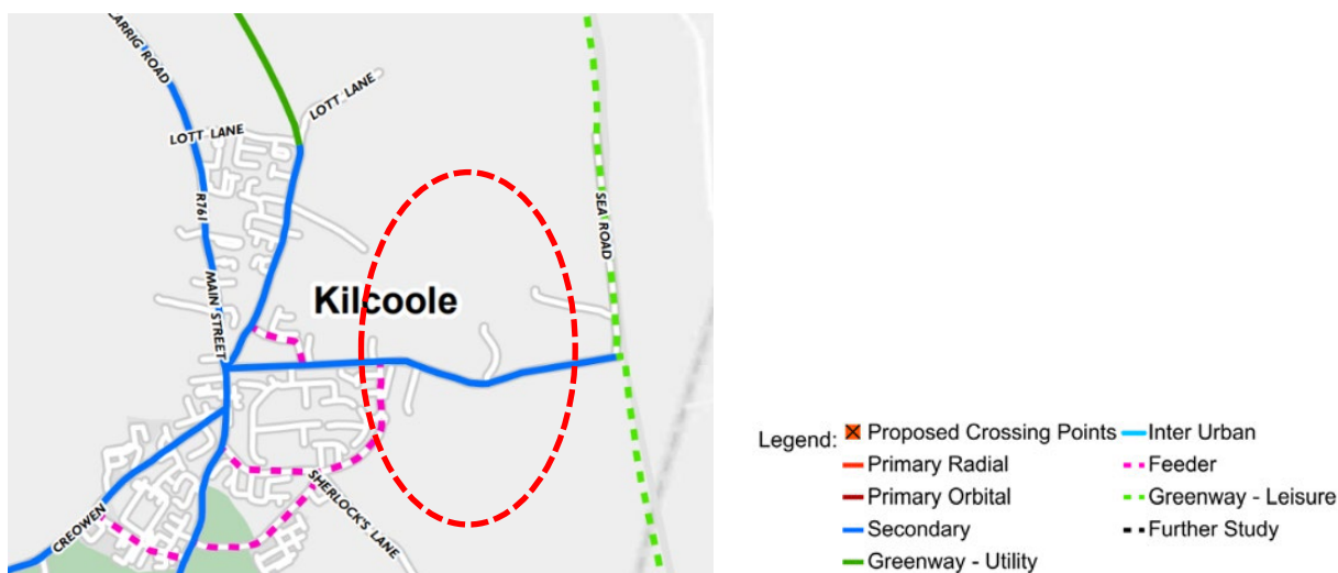
Figure 2: Excerpt of GDA Cycle Network

From the above, it is clear that there is a presumption in favour of zoning lands for development close to public transport in circumstances where additional housing is needed. The site is also accessible to an enhanced cycle network with potential for enhanced pedestrian footpath linking the town and the rail station thereby moving away from dependence on cars in accordance with national planning and transport guidance.