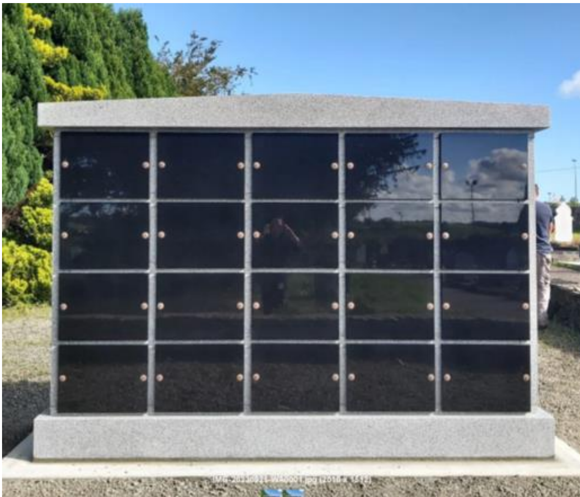
Columbarium Wall – St Gabriel's Cemetery

The use of the Columbarium Wall, and all terms, conditions, rules and regulations relating thereto, is subject to the determination and control of the Environment Section, Wicklow County Council. These terms, conditions, rules and regulations shall be binding upon each and every party purchasing interment rights in the Columbarium Wall.