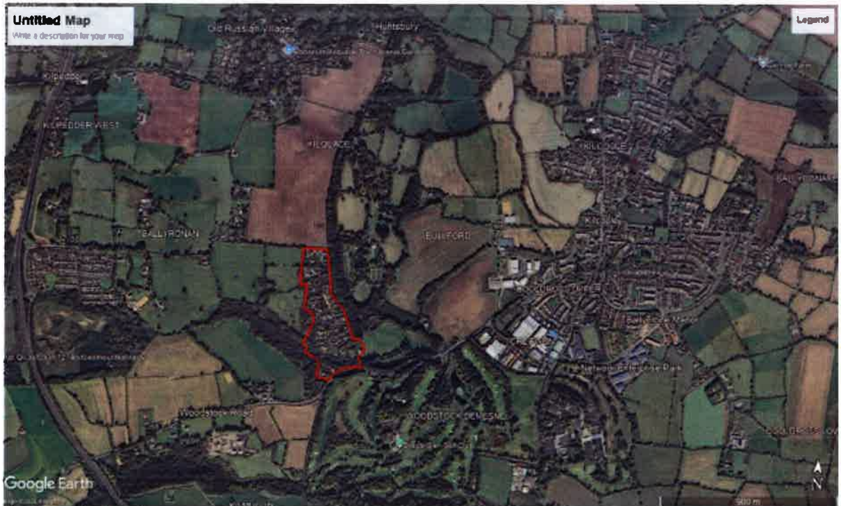
Fig 1 – Site Location