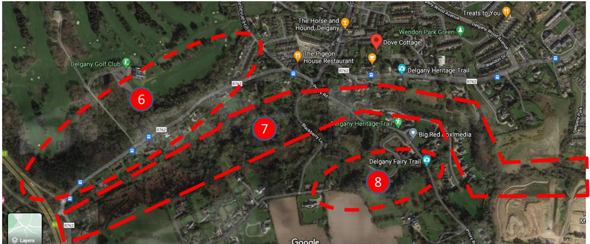
Dancing Trees at Harmon's Brow, Drummin East, south of and adjacent to Delgany Village proposed for TPOs (9)