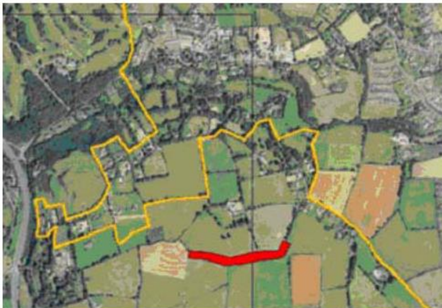
Prominent treeline of Scots pine just outside LAP area (viewed from Kindlestown)

Dancing Trees at Harmon's Brow, Drummin East, south of and adjacent to Delgany Village proposed for TPOs (9) – following 2 photos from LAP 2006 -2012 [1]