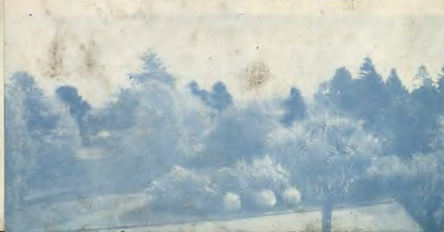
Below —A CORNER IN THE EXTENSIVE GARDENS

which are laid out under ideal conditions, contain many rare and beautiful trees and shrubs. The tennis and croquet lawns, in their sheltered positions, are very popular retreats in the spring and summer months as is also the 9-hole putting course.