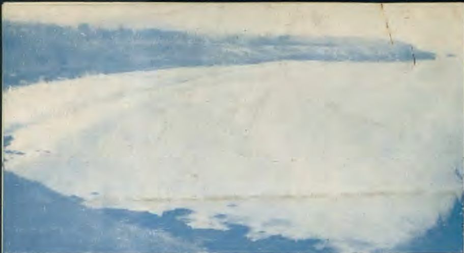
Above —THE BATHING STRAND