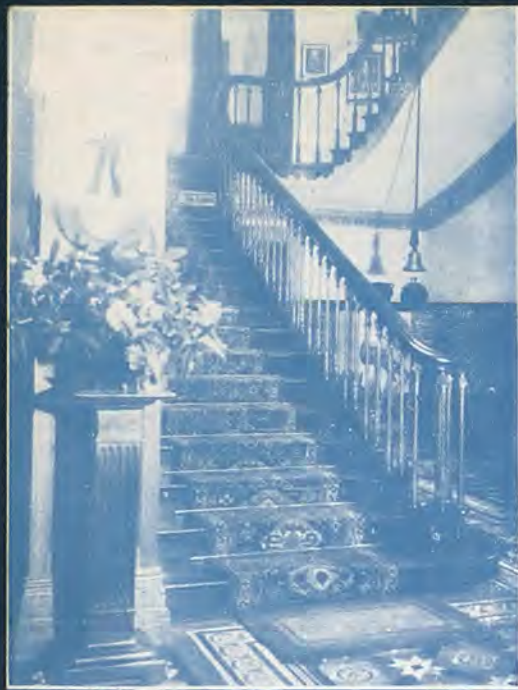
Above—THE GRAND STAIRCASE