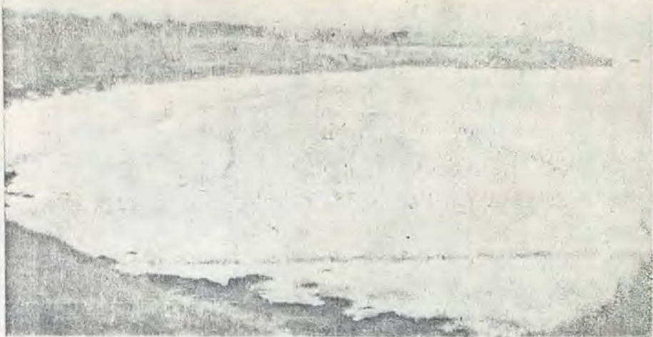
Above - THE BATHING STRAND