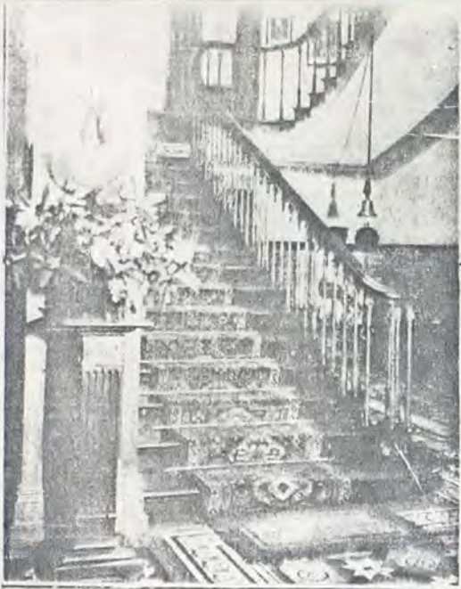
Above—THE GRAND STAIRCASE