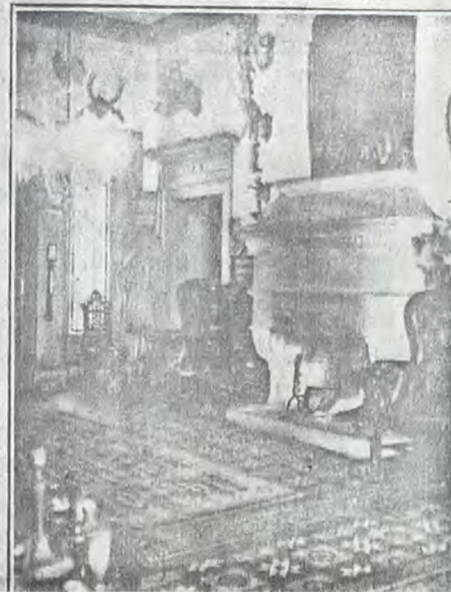
Below THE LOUNGE HALL