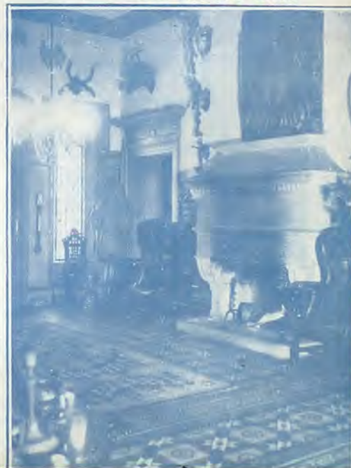
Below—THE LOUNGE HALL