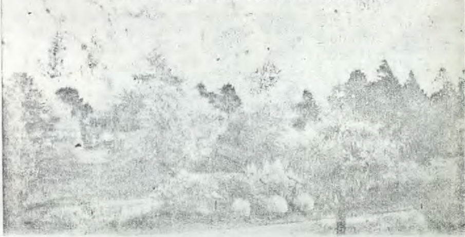
Below - A CORNER IN THE EXTENSIVE GARDENS

which are laid out under ideal conditions, contain many rare and beautiful trees and shrubs. The tennis and croquet lawns, in their sheltered positions, are very popular retreats in the spring and summer months as is also the 9-hole putting course.