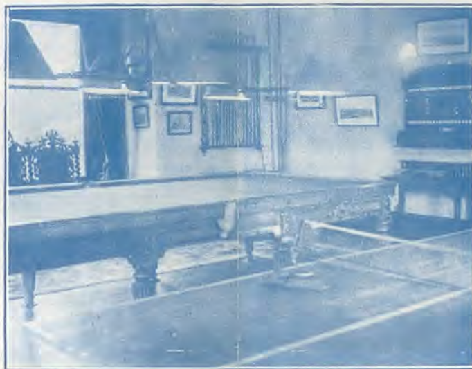
A CORNER OF THE BILLIARD ROOM

Shooting is available to guests over the entire property. Trout fishing is also to be had in Three-Mile Water River which bounds