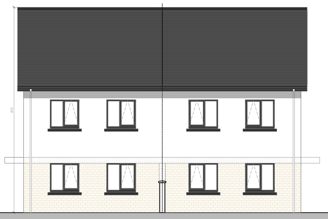
01 FRONT ELEVATION