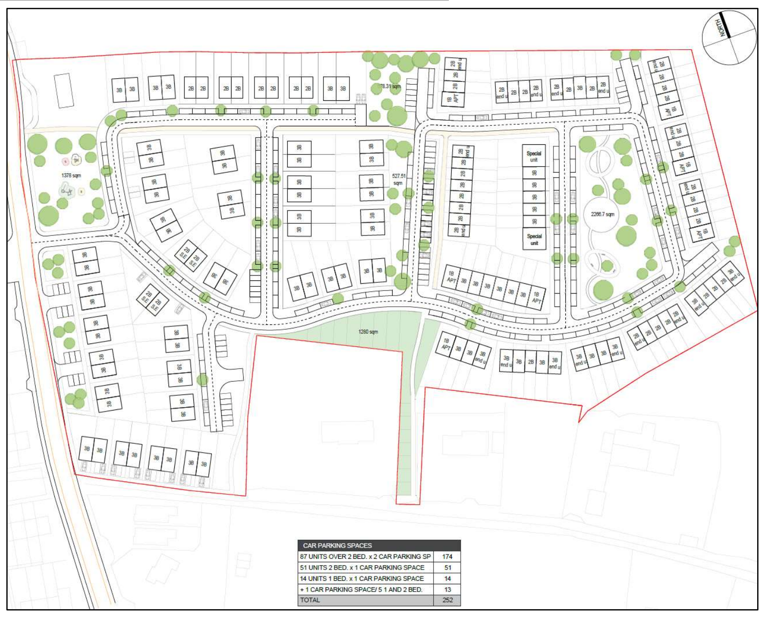
Figure 3. Site layout of the proposed development.