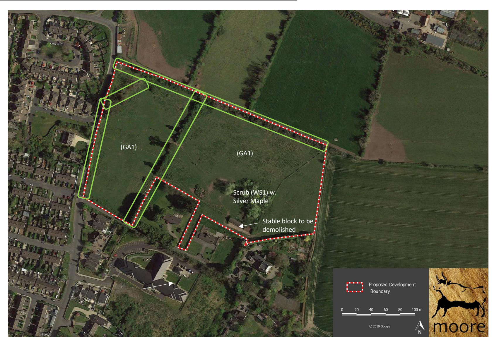
Figure 6. Habitat map based on recent aerial photography.