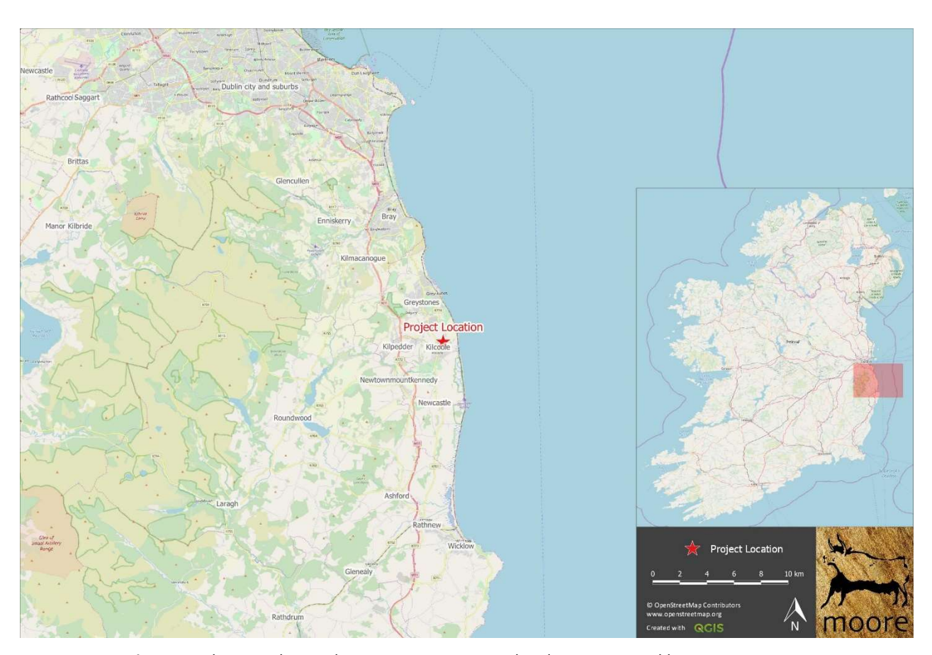
Figure 1. Showing the site location at Lott Lane, Kilcoole, County Wicklow.

The site location is presented in Figure 1 below.