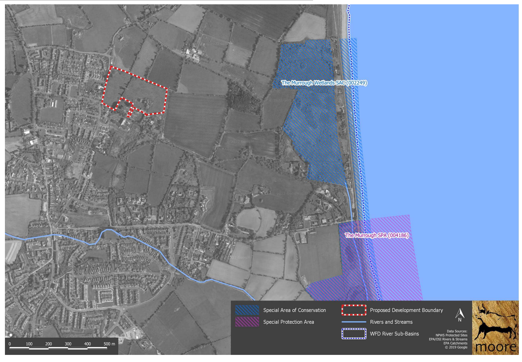
Figure 5. Detail of designated conservation sites in the vicinity of the Project site.