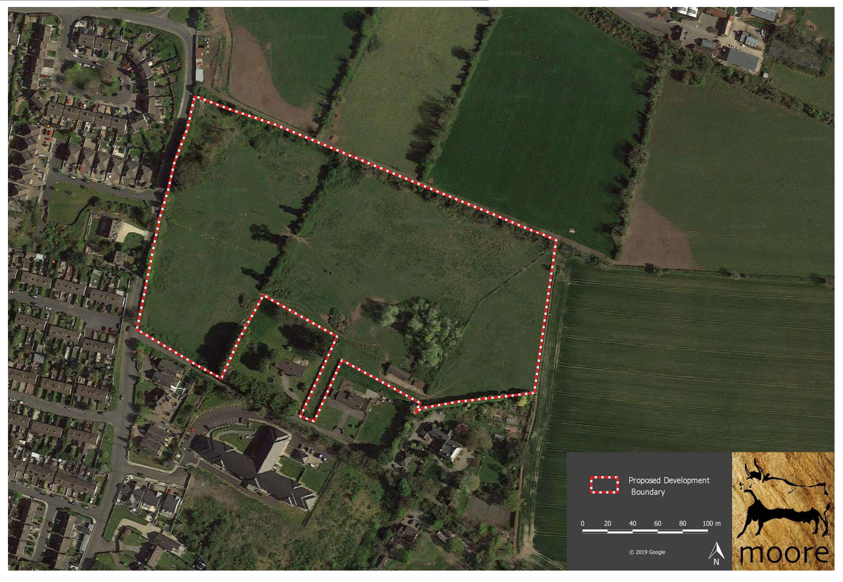
Figure 2. Showing the indicative site and overall land holding on recent aerial photography.