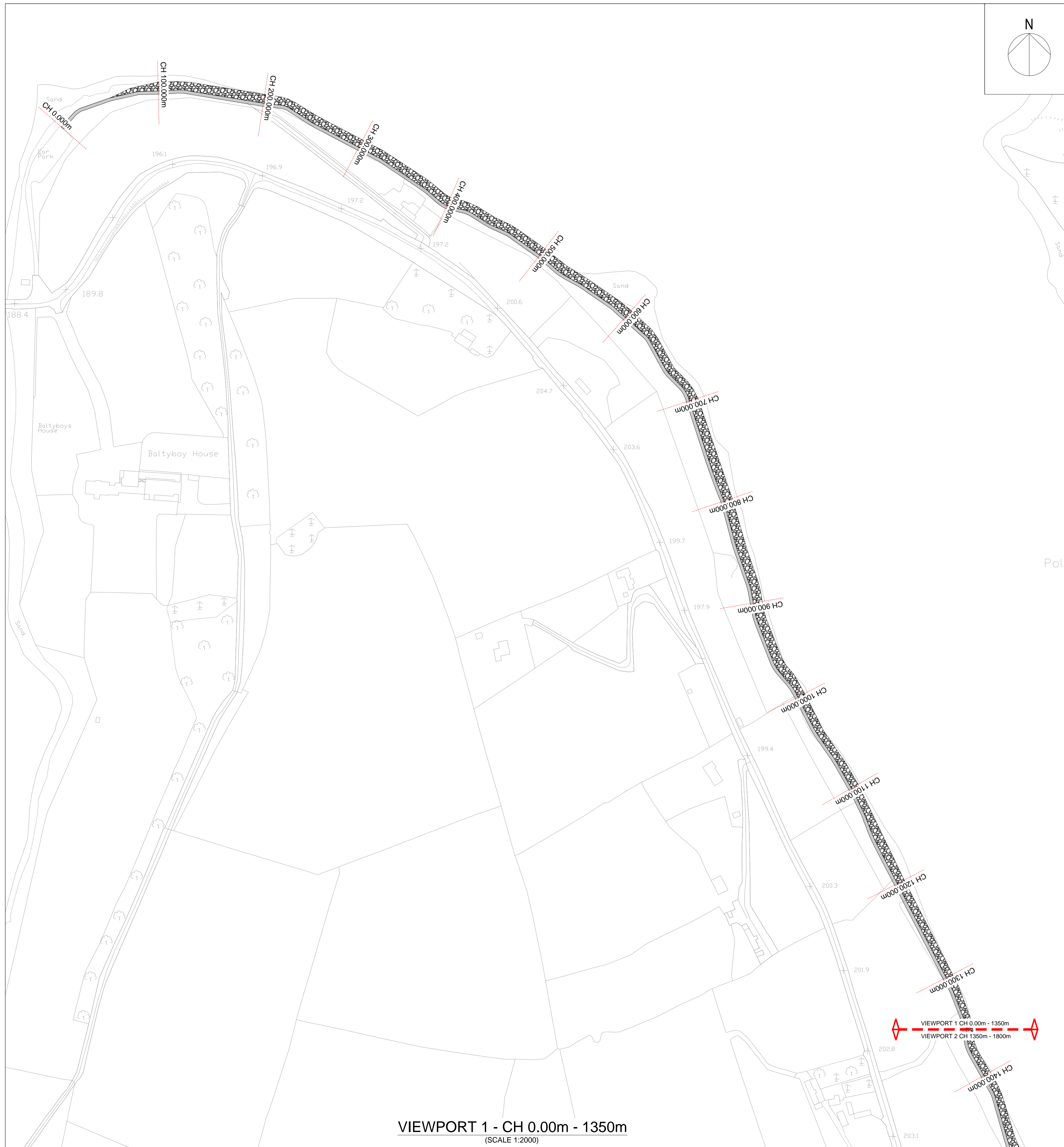
VIEWPORT 1 - CH 0.00m - 1350m (SCALE 1:2000)