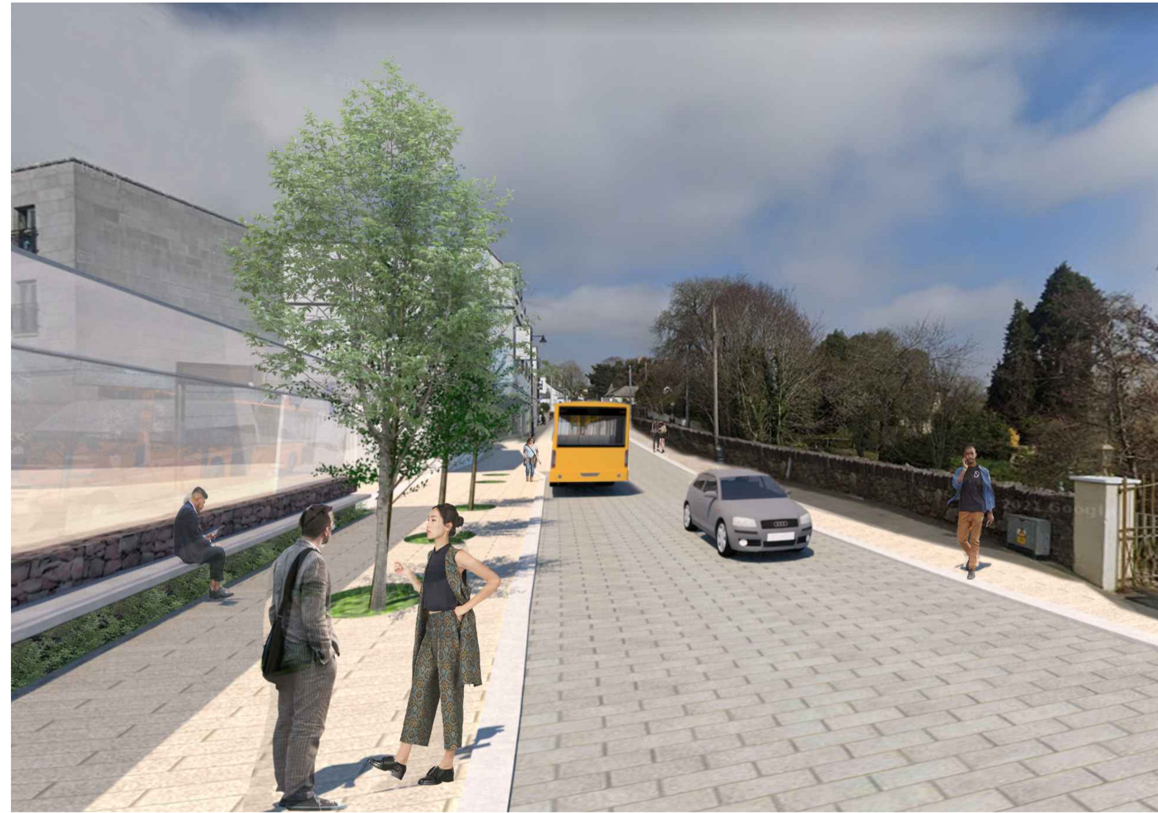
PROPOSED CIVIC SPACE - VIEW 01 N.T.S