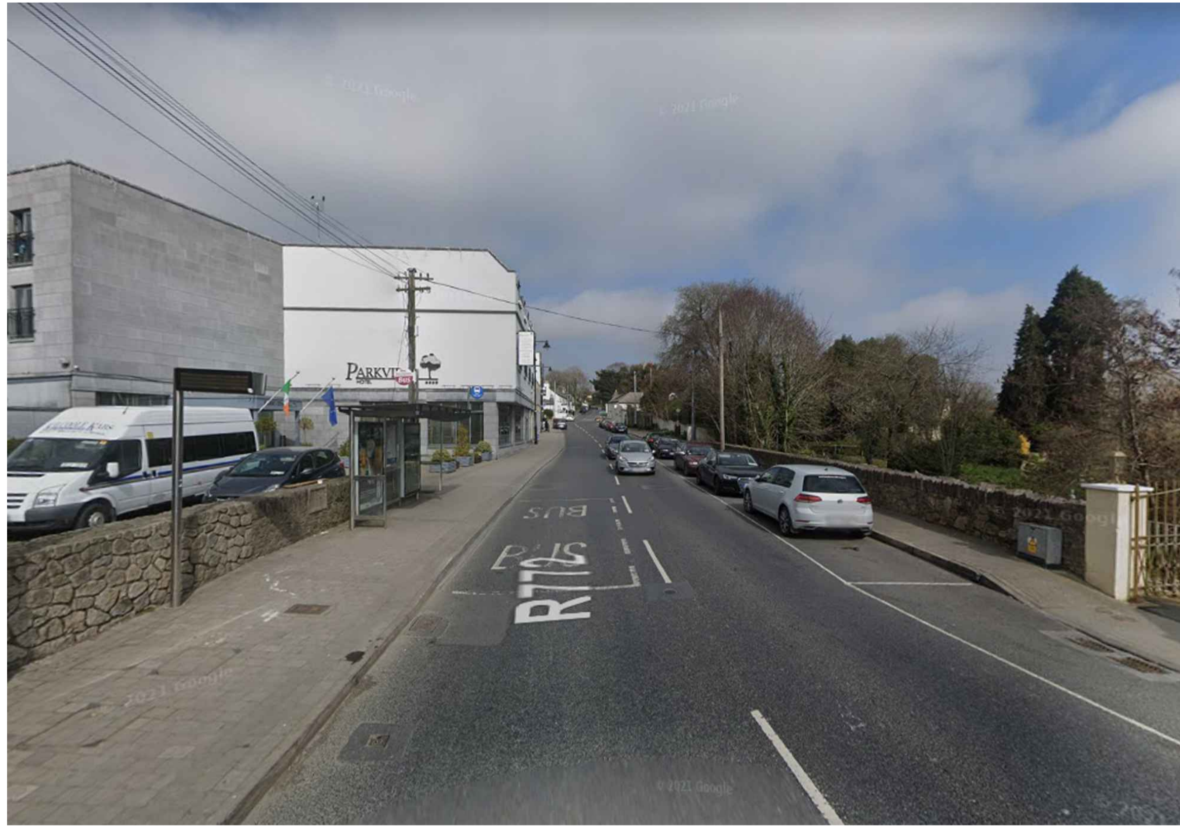
EXISTING ROAD - VIEW 01 N.T.S