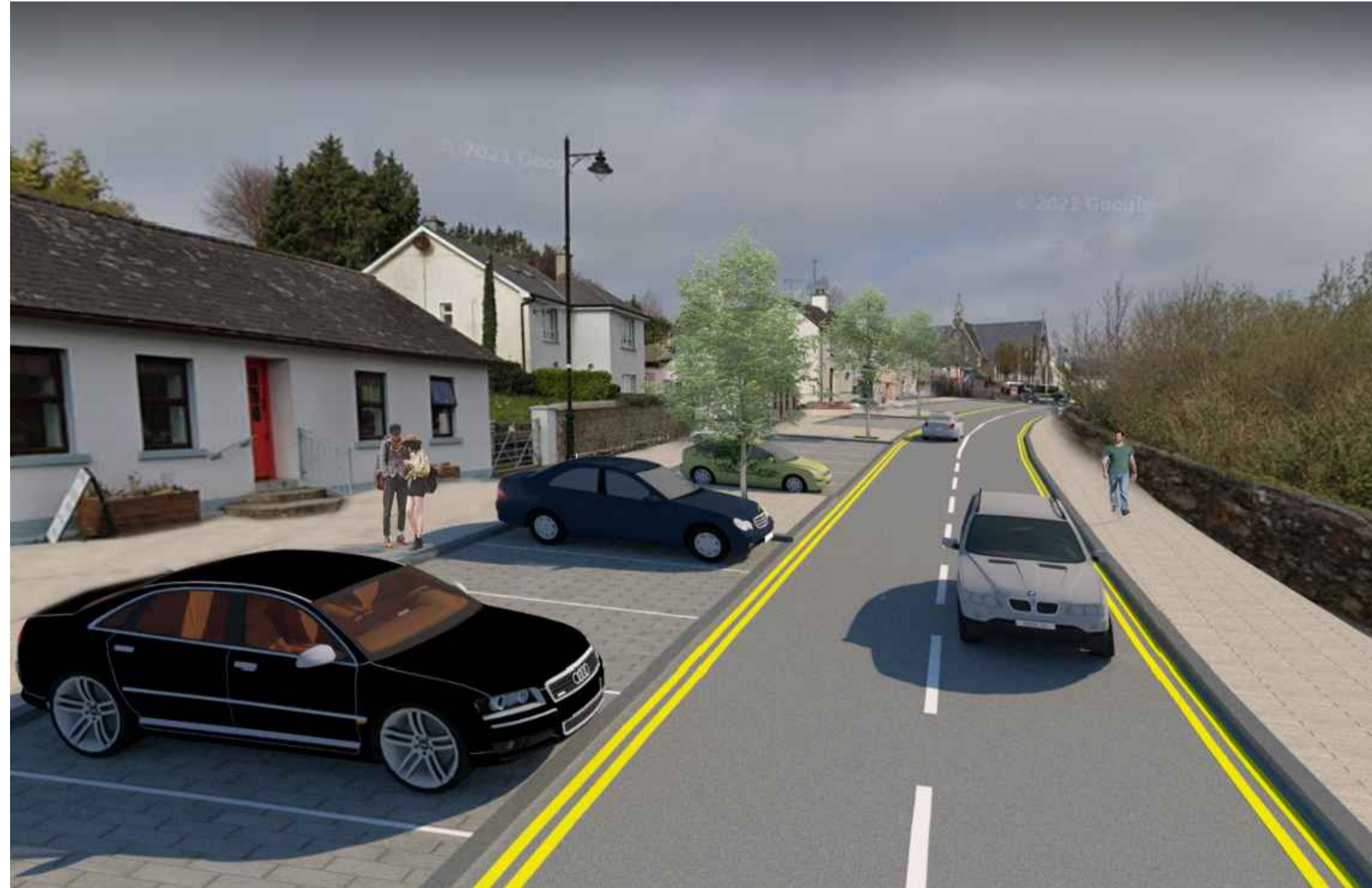
PROPOSED ROAD IMPROVEMENT - VIEW 02 N.T.S

ORDNANCE SURVEY OF IRELAND LICENCE NO. CYALS0213875 © GOVERNMENT OF IRELAND