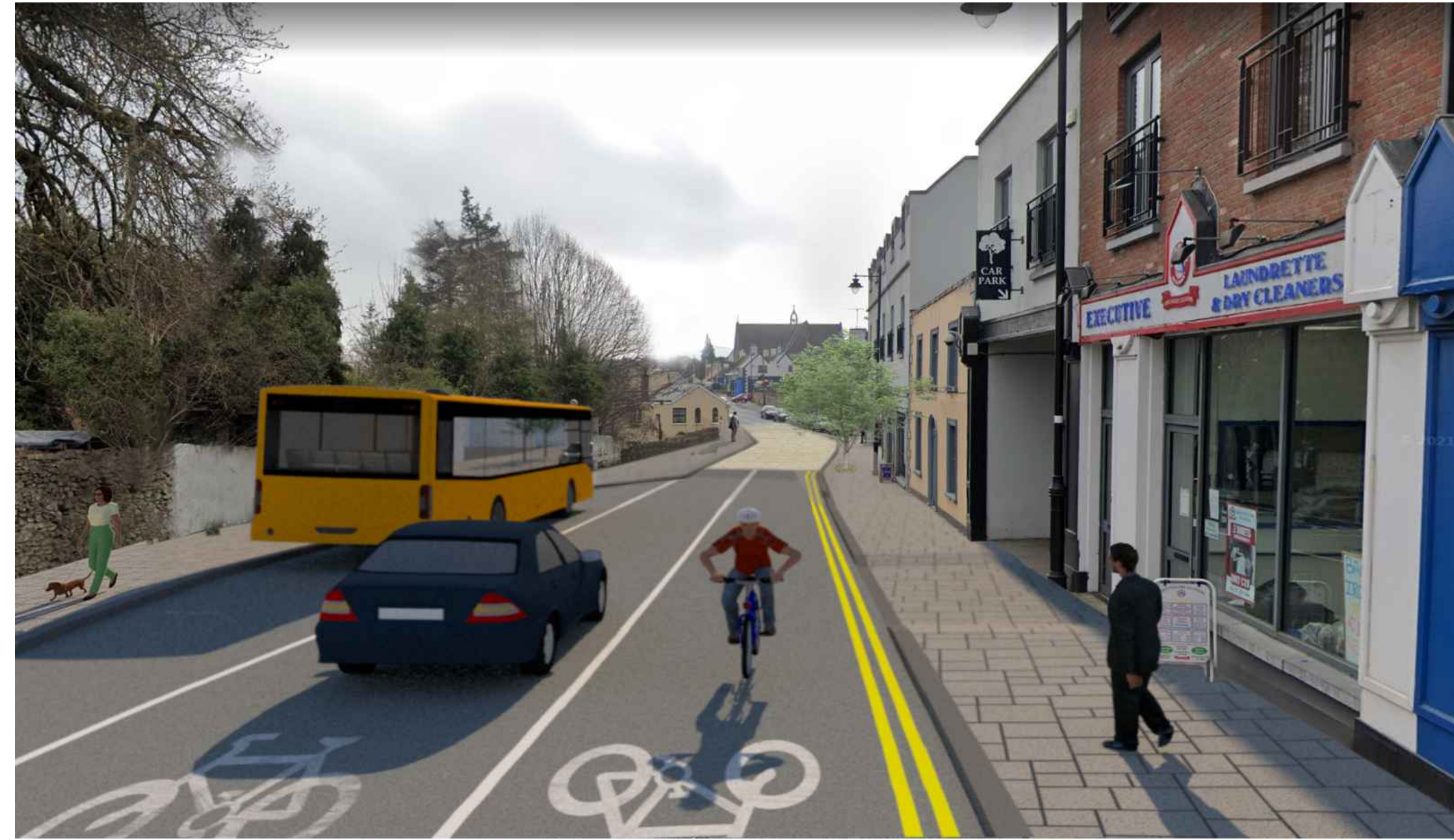
PROPOSED CIVIC SPACE - VIEW 01 N.T.S