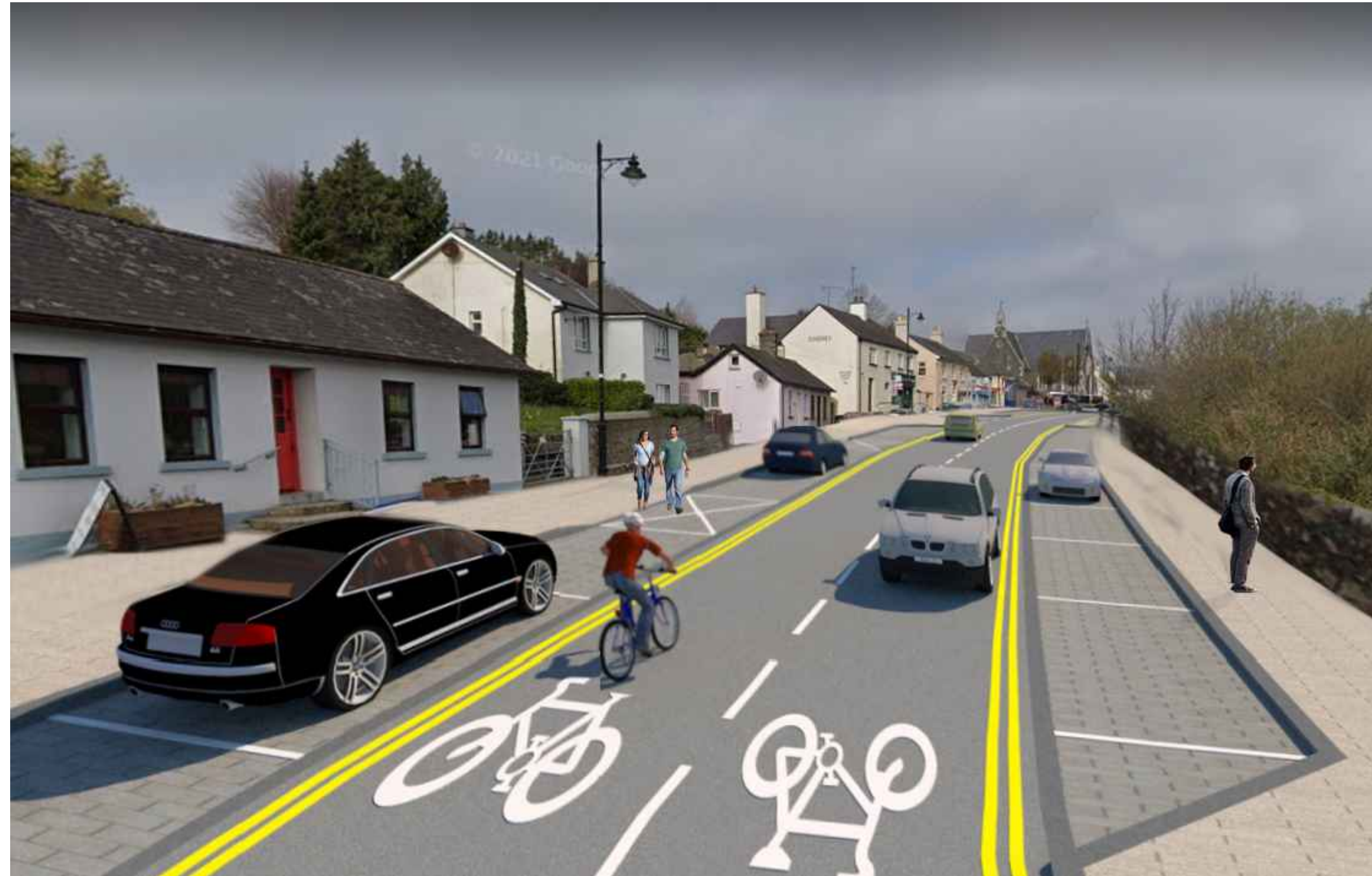
PROPOSED ROAD IMPROVEMENT - VIEW 02 N.T.S

ORDNANCE SURVEY OF IRELAND LICENCE NO. CYALS0213875 © GOVERNMENT OF IRELAND