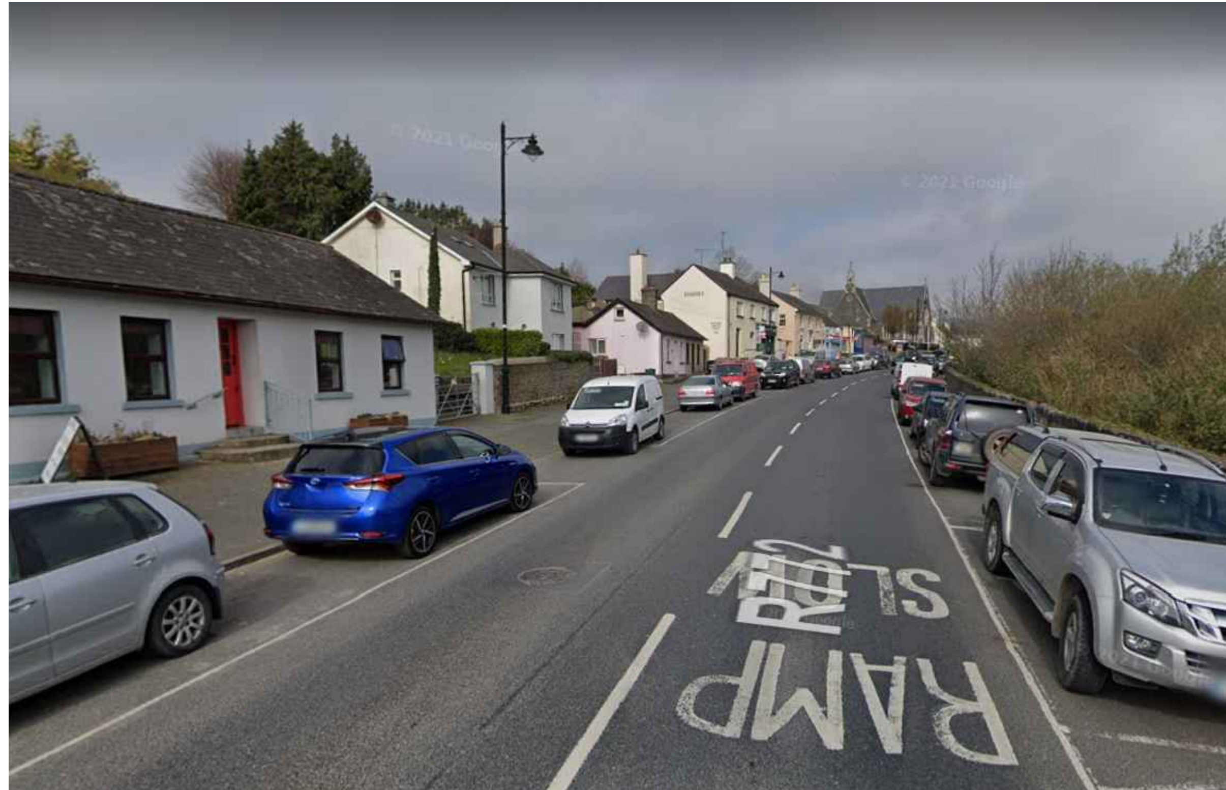
EXISTING ROAD - VIEW 02 N.T.S