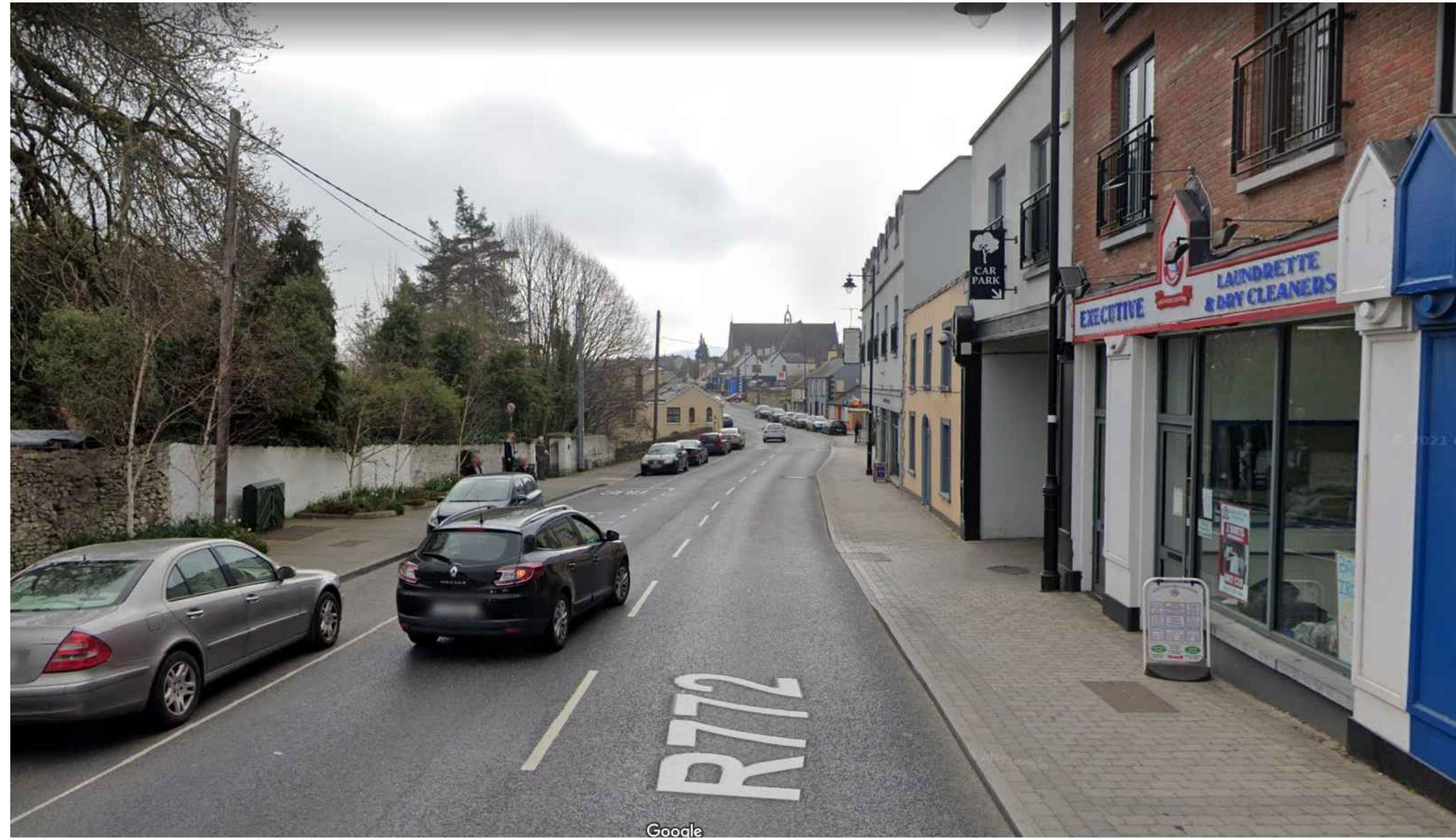
EXISTING ROAD - VIEW 01 N.T.S