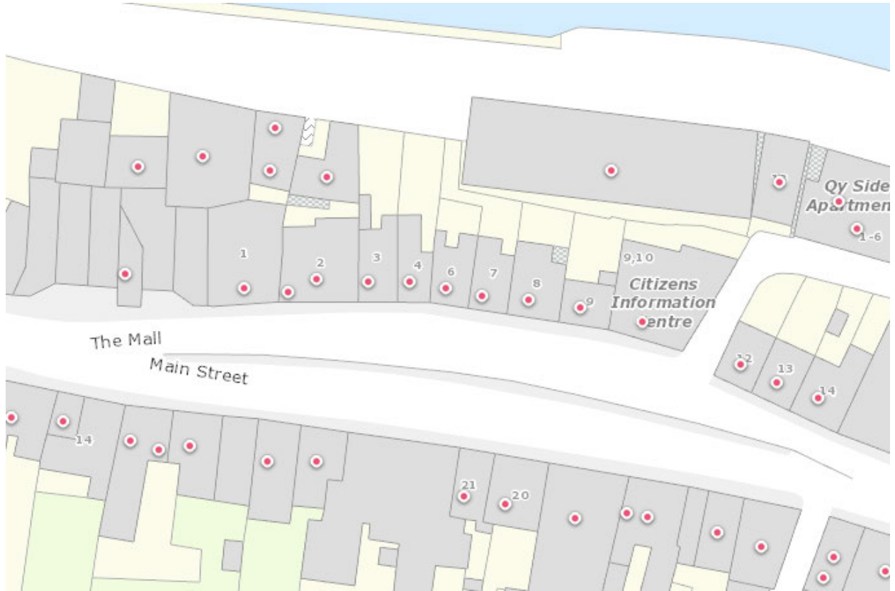
The Mall, Wicklow Town