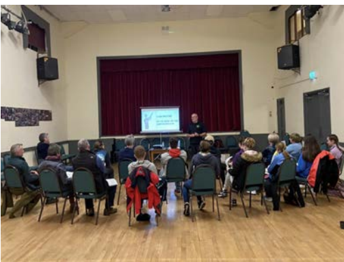
Indoor training, lectures & theory