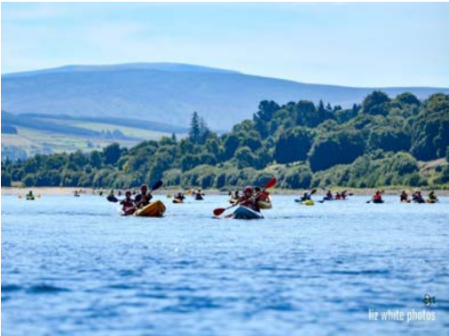
Club paddles on the lake.