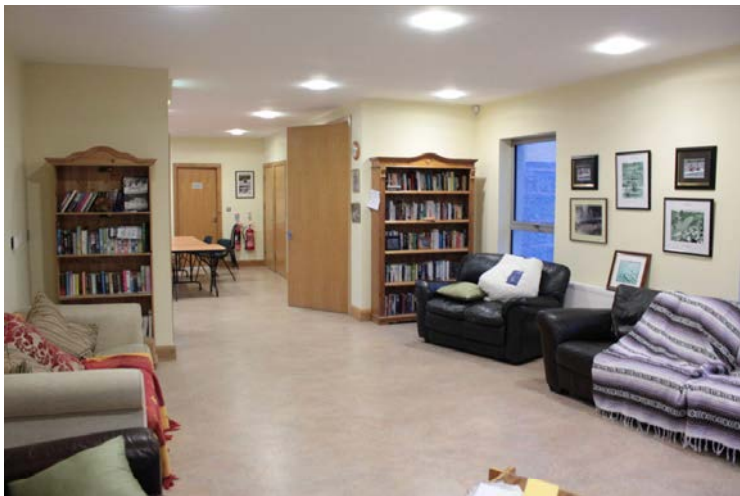
Teaching & Meeting areas