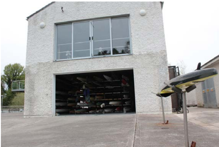
Building with boat storage & facilities