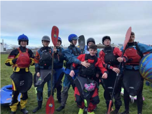
Junior training and summer camps