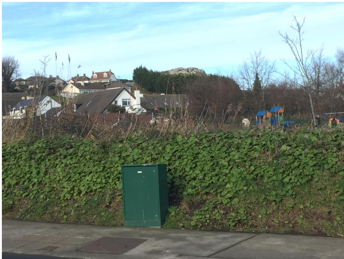
Fig 1. Photo of the Rock from Sea Road at Beachdale entrance